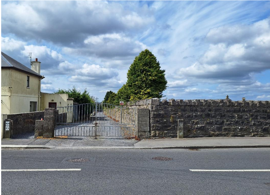
Fig 2 : One of two entrances from the R347

Access to the burial area would be from the existing gateways on the R347, through internal roadway and onwards to the new gated entrance at the designated area.