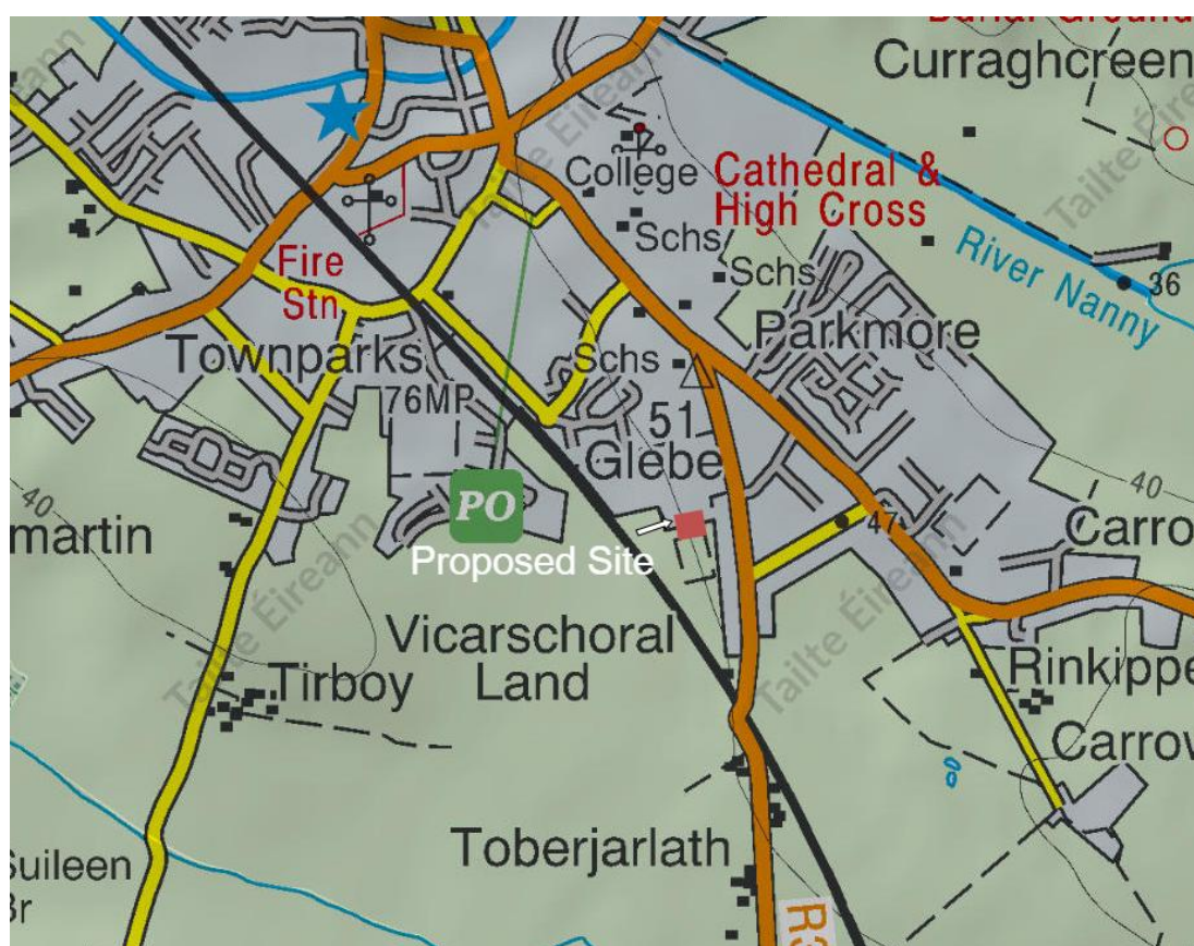
Fig 1 : Location Map

The site of the proposed development is adjacent to the main cemetery in Tuam town located off the Athenry Road. The site is in the ownership of Galway County Council, measures 0.095 acres and comprises of a field of improved grassland.