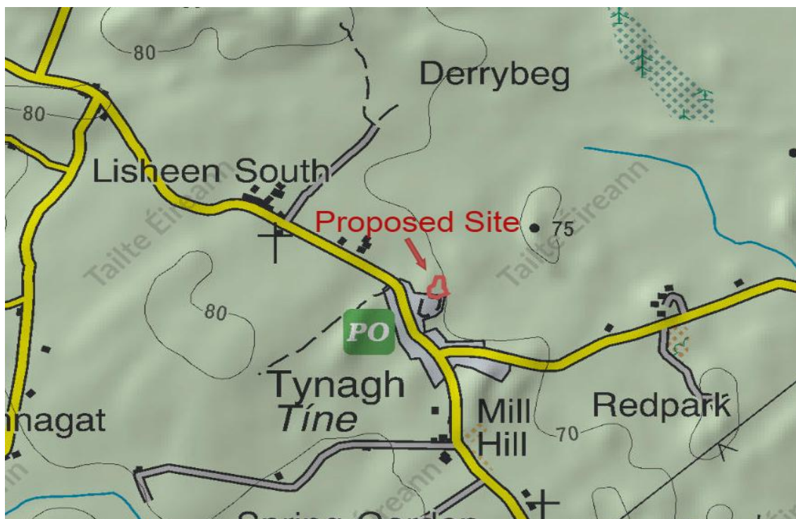
Fig 1 : Location Map

The site of the proposed development is in the village of Tynagh and adjacent to the existing cemetery at the north end. The site is in the ownership of Galway County Council, measures 0.575 acres and comprises of a field of recently cleared vegetative overgrowth.