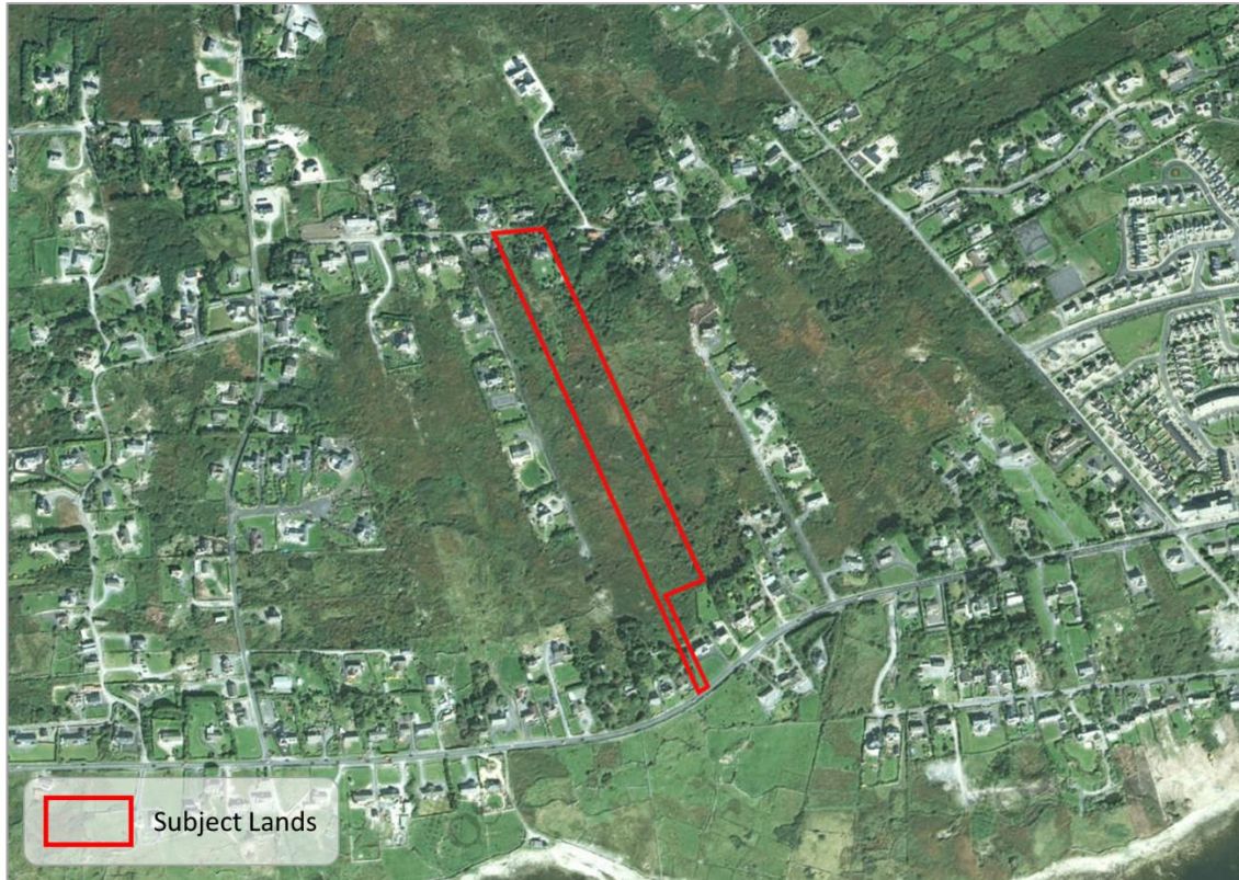
Figure 2: Extent of Subject Lands