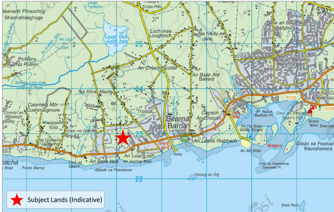
Figure 1: Location of Subject Lands within Wider Context

The subject lands are located in Forramoyle East, Bearna, Co. Galway. Figure 1 below illustrates the location of the lands within the wider area, with Figure 2 outlining the site boundary that the lands extend to.