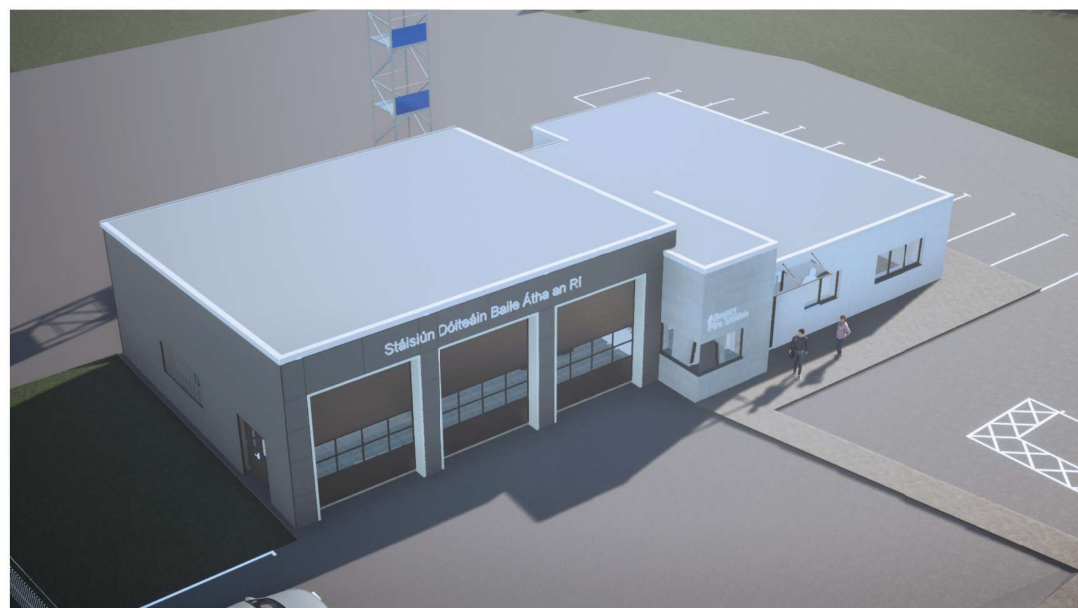
3D View - Not to scale