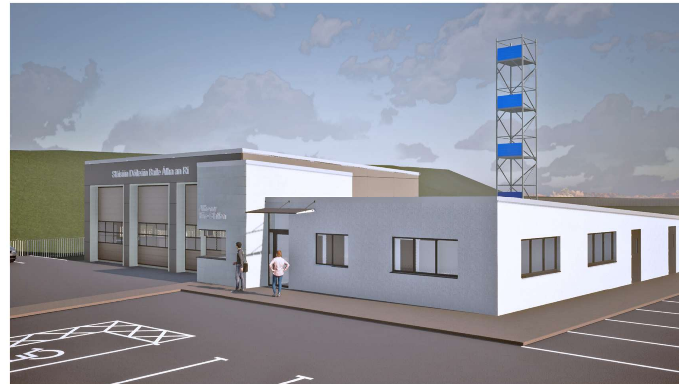
3D View - Not to scale