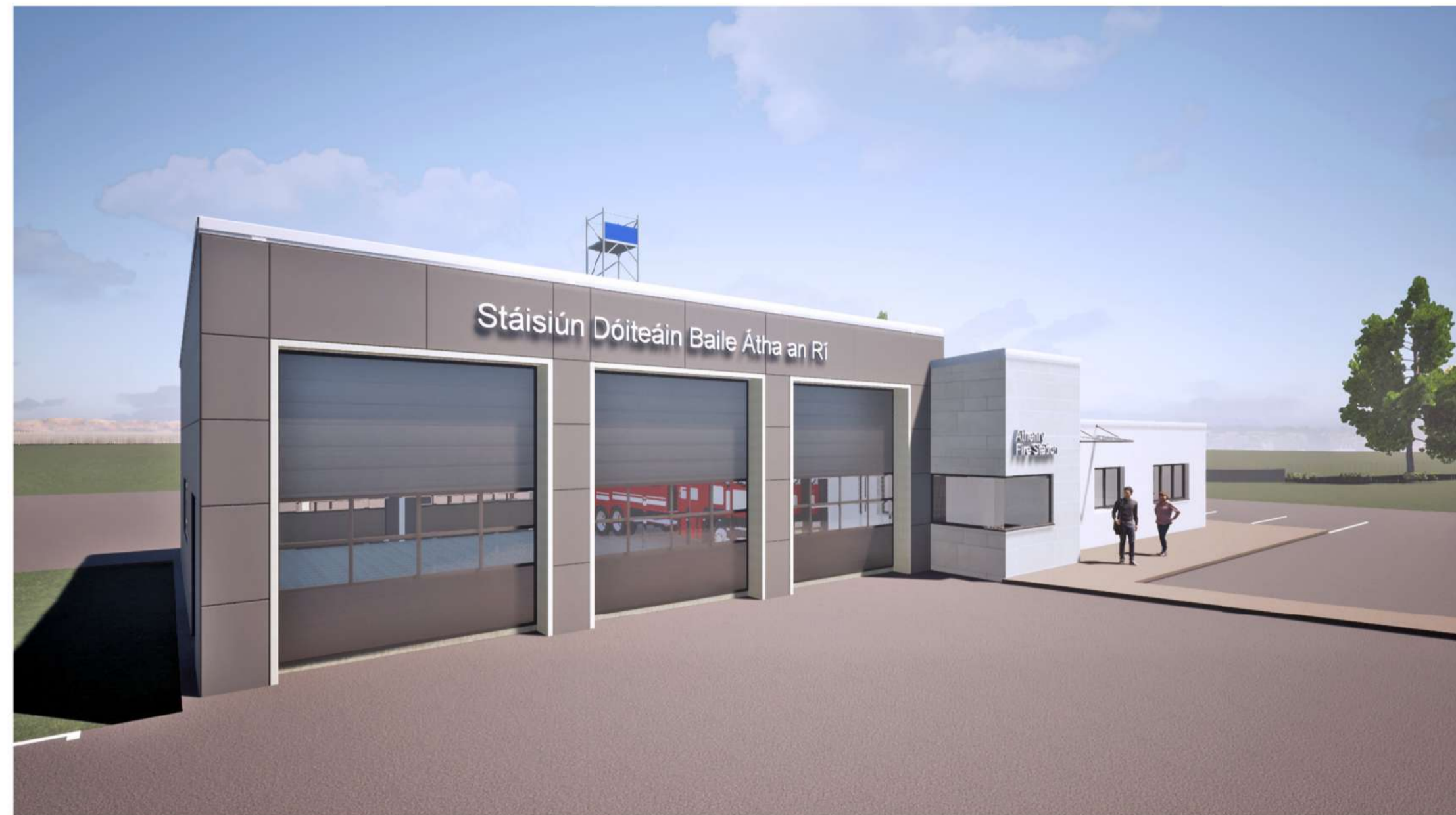
3D View - Not to scale