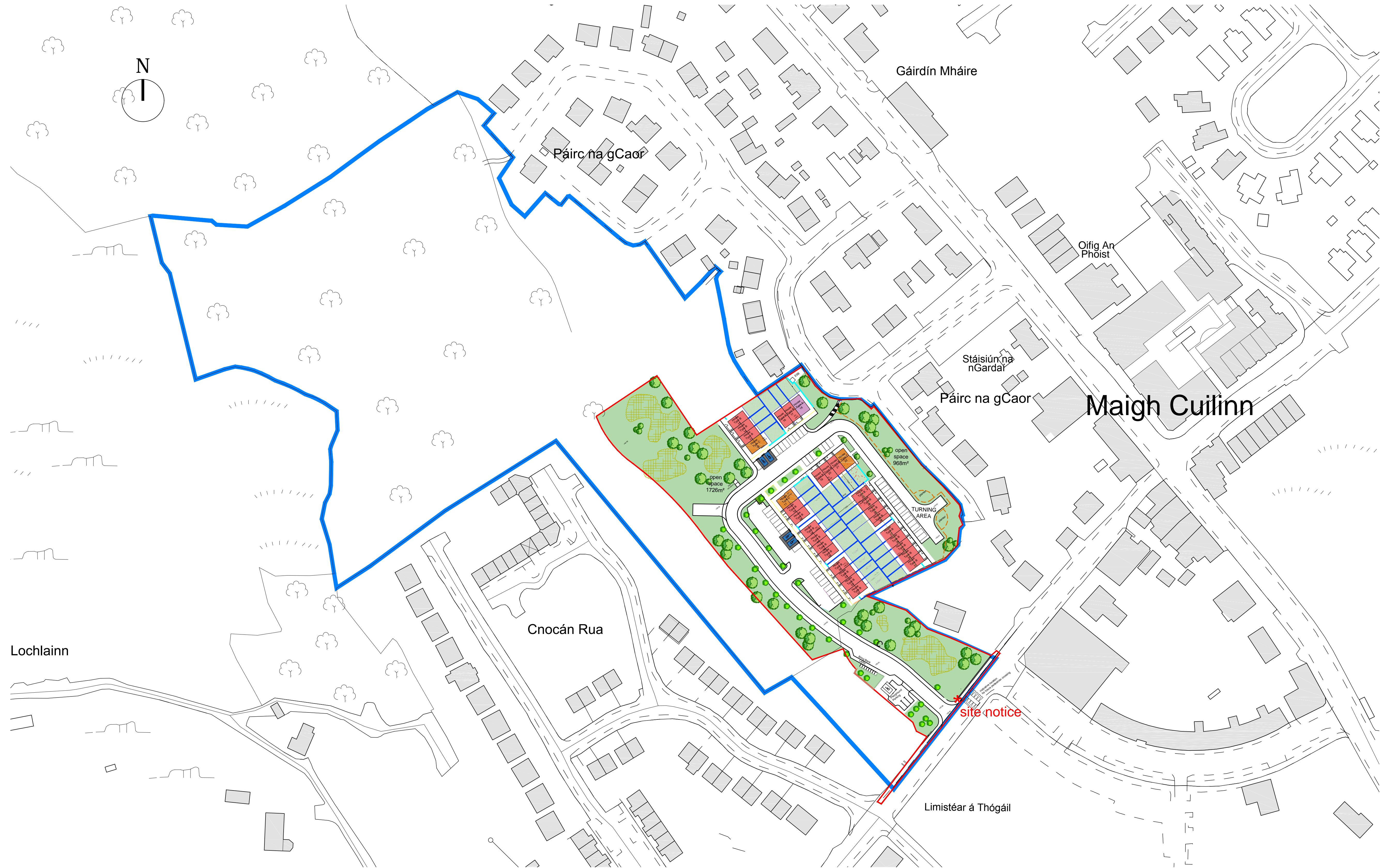
SITE LOCATION PLAN ( SCALE 1:1000 )

Site Area outlined red is 17114m2 or 1.7 hectares open space provided is 3,479m2 or 20%