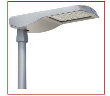
36w LED on 6m Pole - By Electrical Contractor