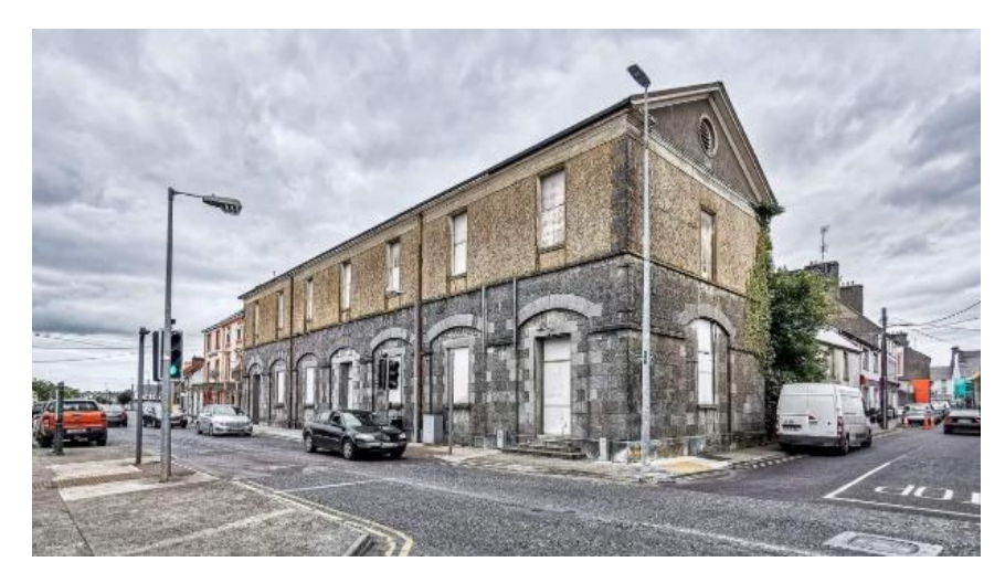
Figure 2. Townhall building in the streetscape – Barrack Street