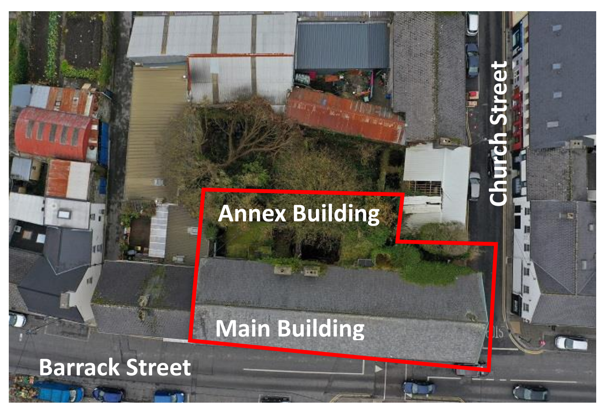
Figure 1. Townhall building in context – Aerial View