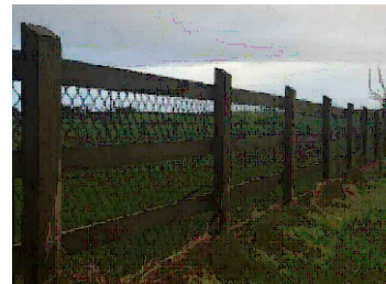
Picture of the post and rail fence proposed for use where noted on the drawing.