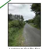
Looking to Cul-De-Sac