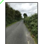
Looking to L-7103

Existing hedge to be cut to accommodate the safe entry and exit of vehicles from the burial ground