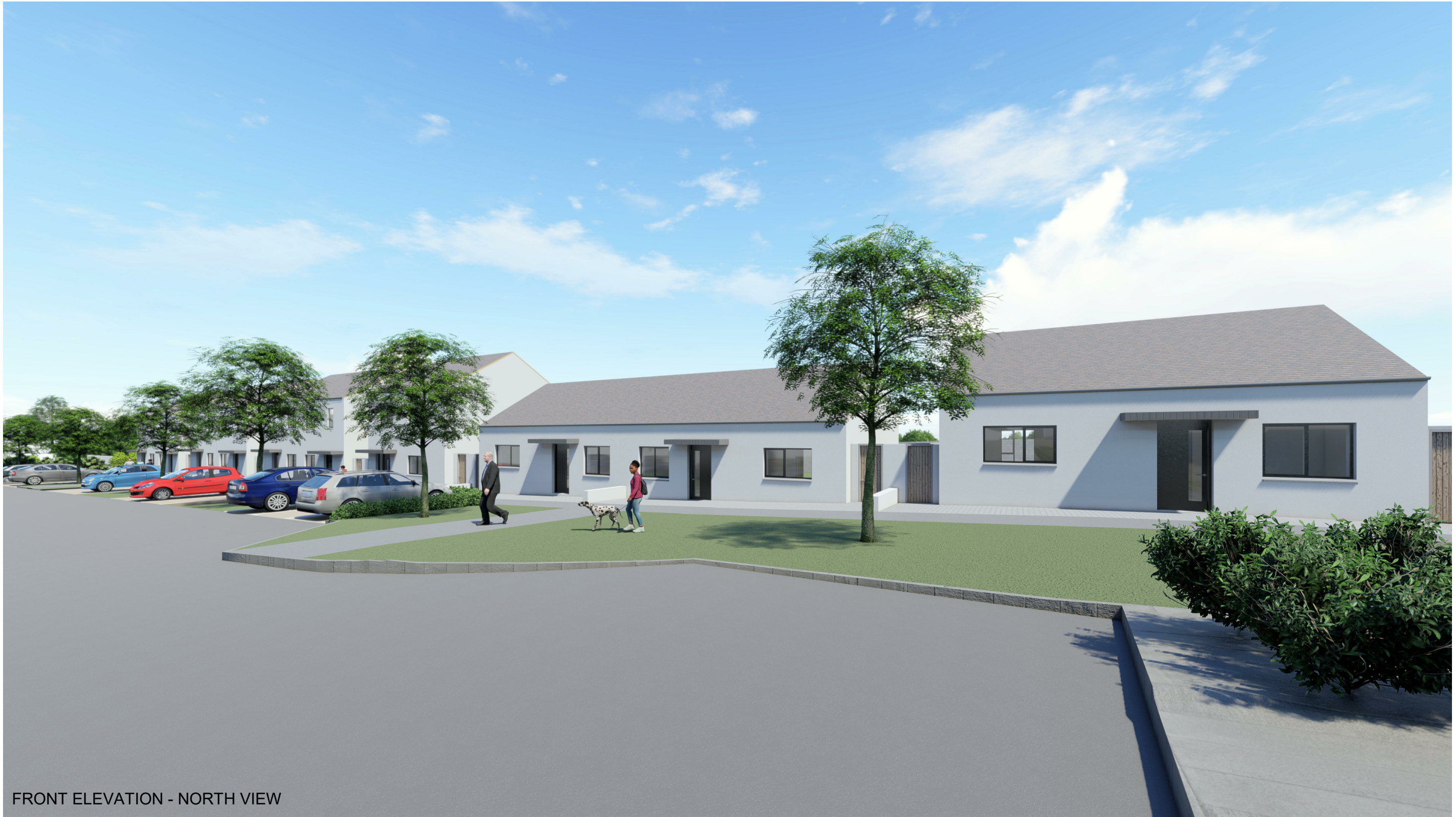
FRONT ELEVATION - NORTH VIEW