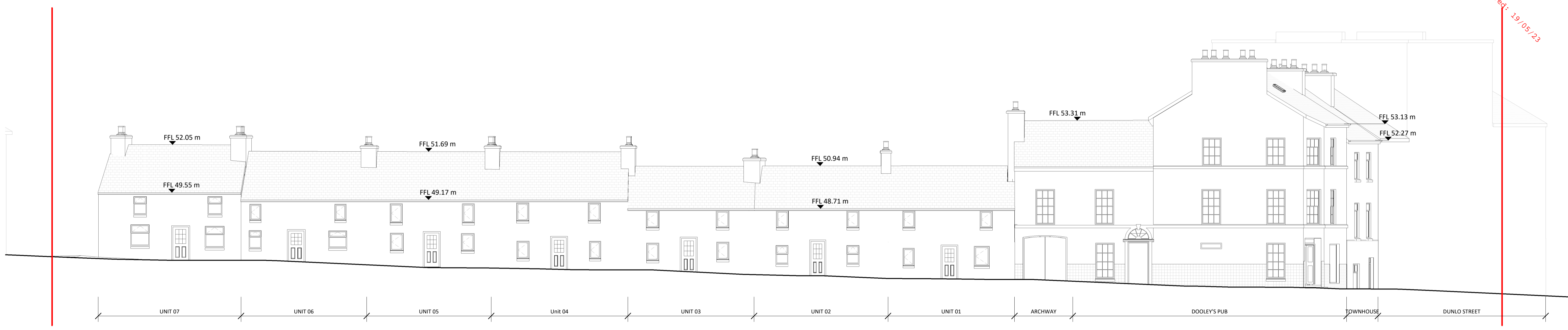
1 Existing_SW Street Elevation 1:100