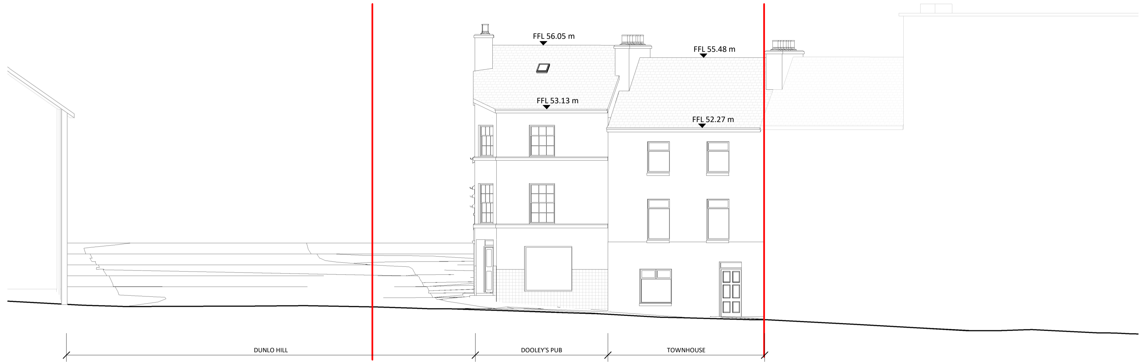
01 Existing_SE Street Elevation 1:100