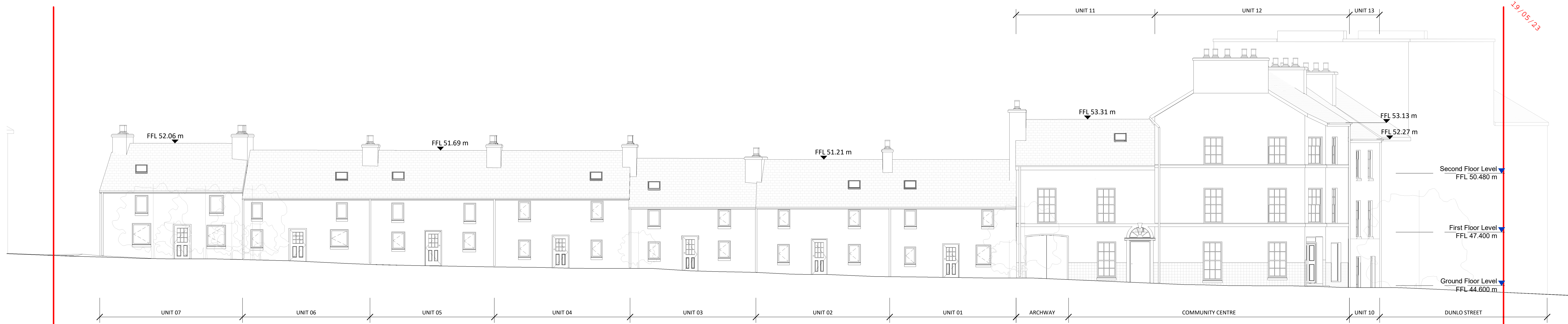
1 GA_SW Street Elevation