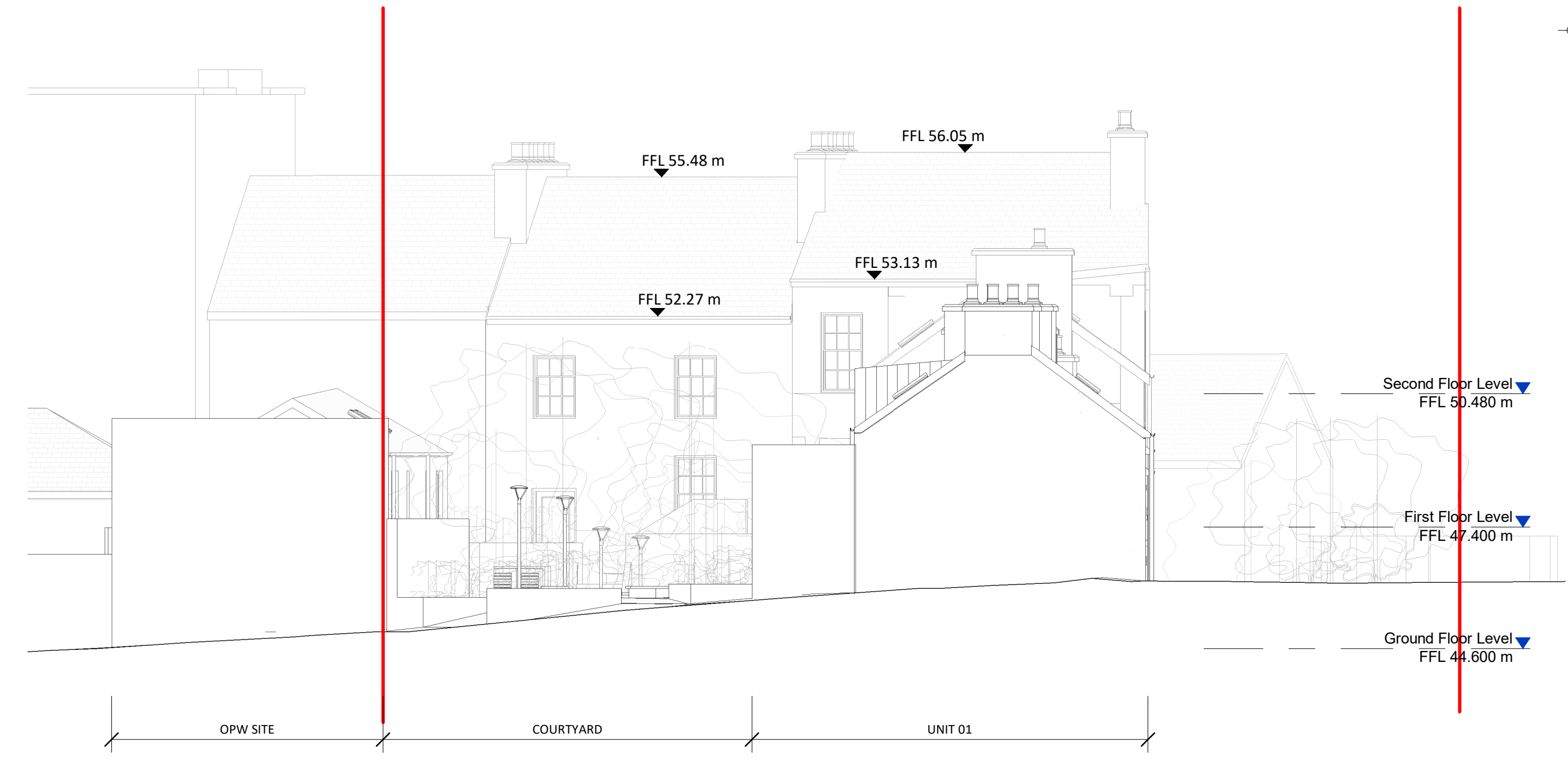
3 GA_NW Street Elevation