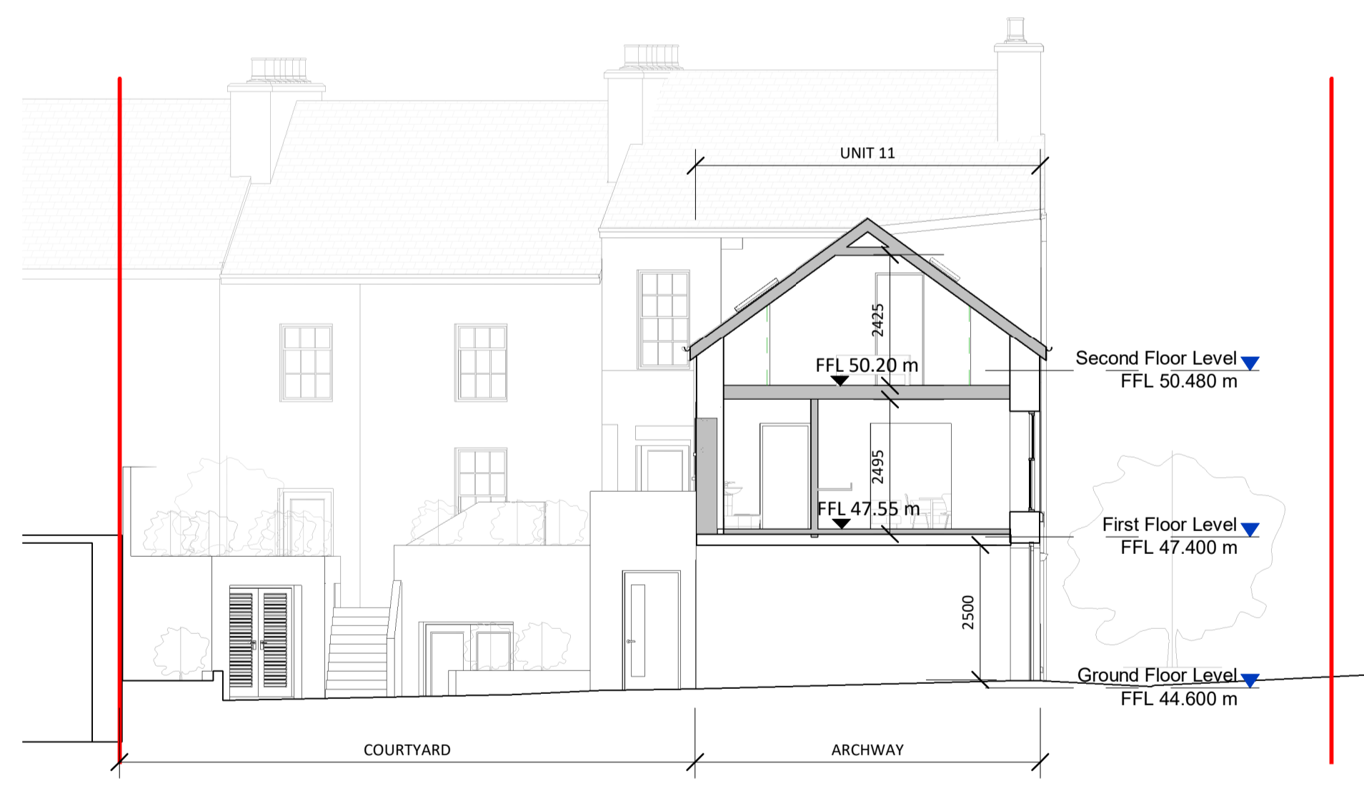
2 GA_Unit 11-Cross Section 1 : 100