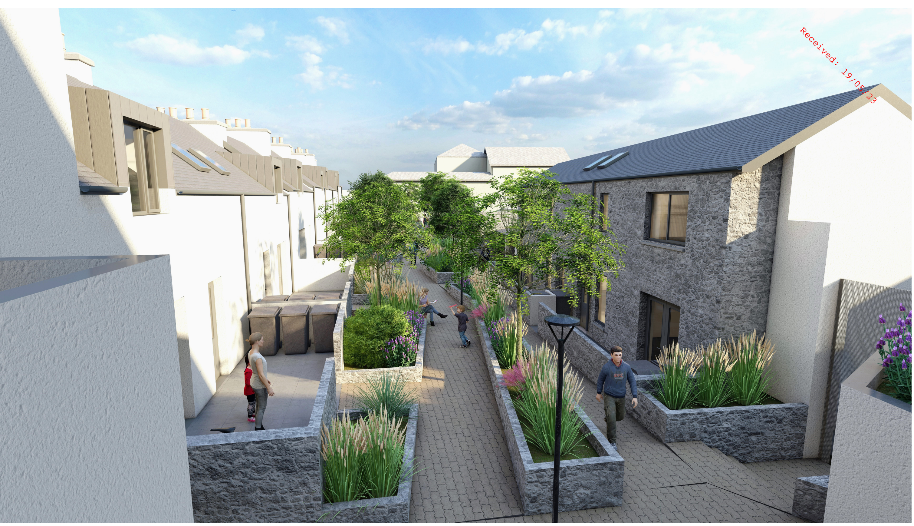
VIEW OF COURTYARD FROM PODIUM