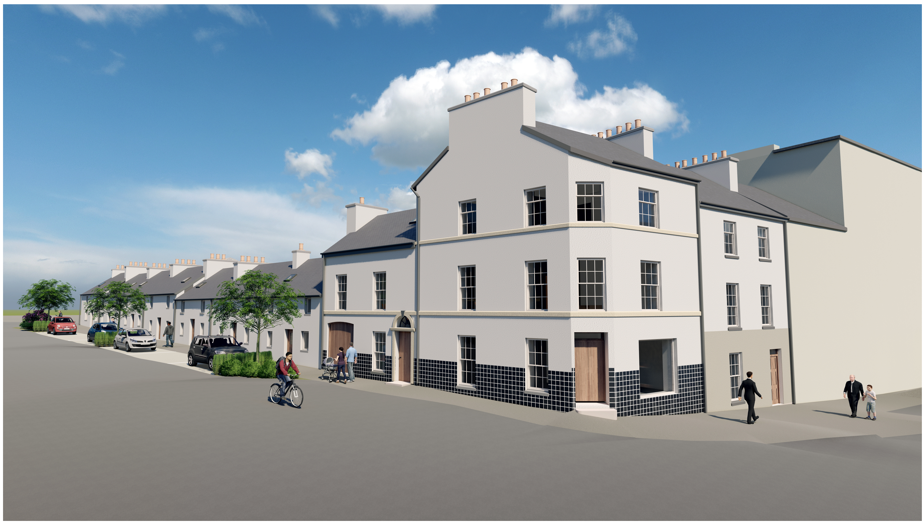
NORTH-WEST STREET VIEW FROM DUNLO HILL & DUNLO STREET