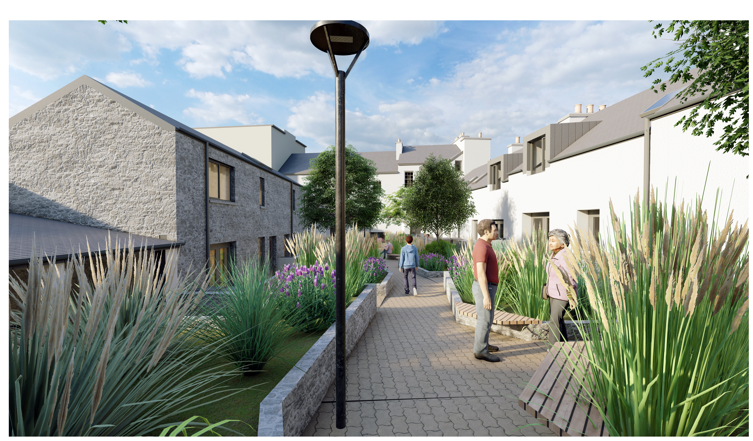
INTERNAL VIEW OF COURTYARD