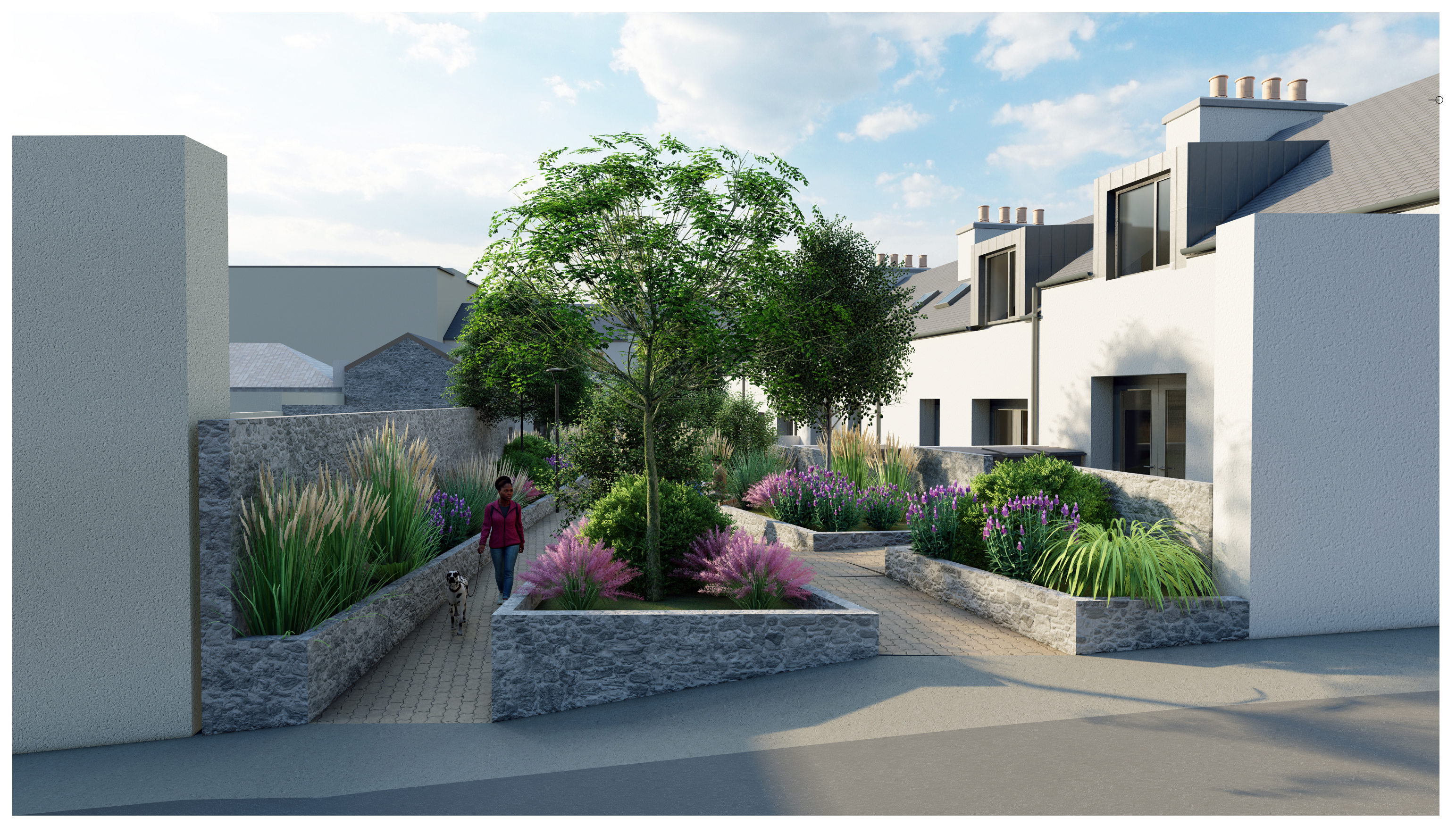
EAST STREET VIEW FROM SIDE LANE