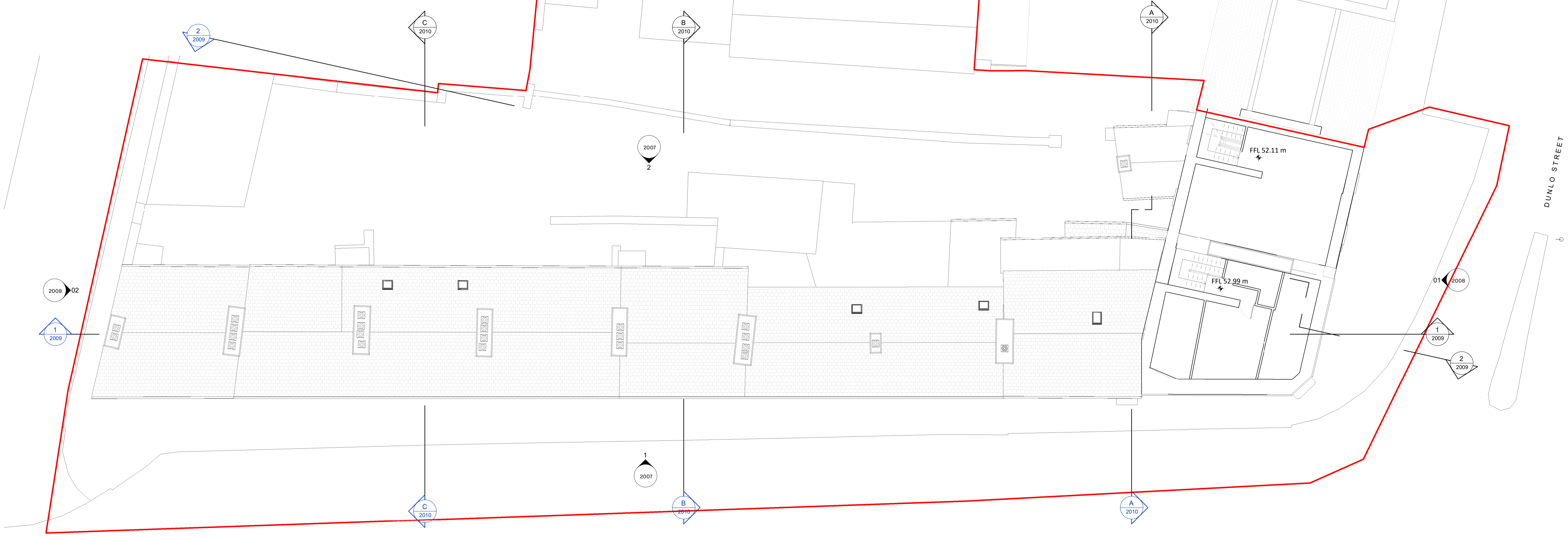
1 -03_Existing_Attic Level 1:100

SITE BOUNDARY SITE AREA = 1698 m 2 = 0.17 Ha