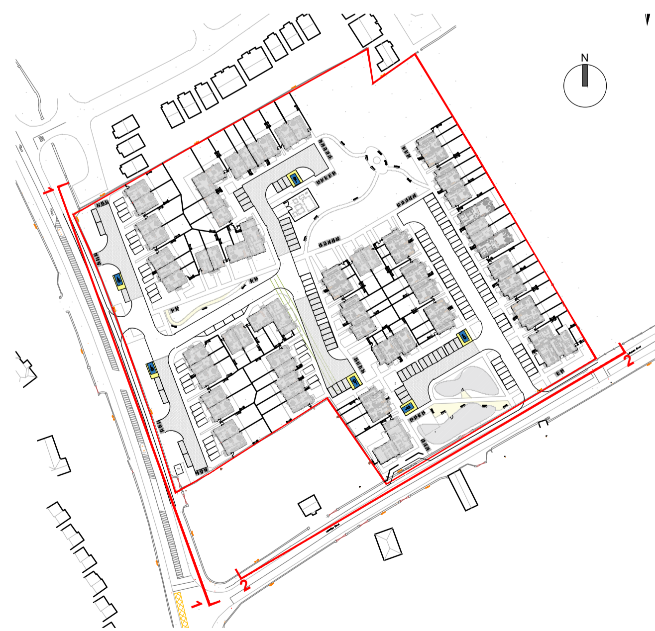
KEY PLAN (Not to scale)

--- 11.38m Level, considered safer from flooding by JBA Report (2020)