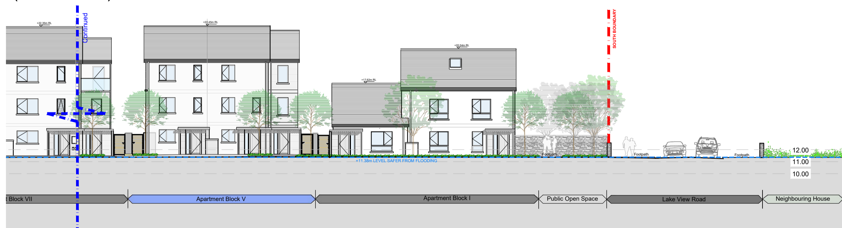
CONTEXT SECTION 6-6 (Continued) (Scale 1:200)