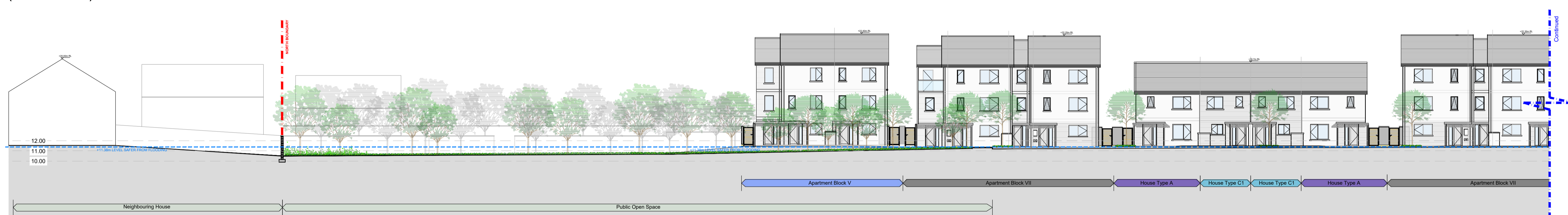
CONTEXT SECTION 6-6 (Scale 1:200)