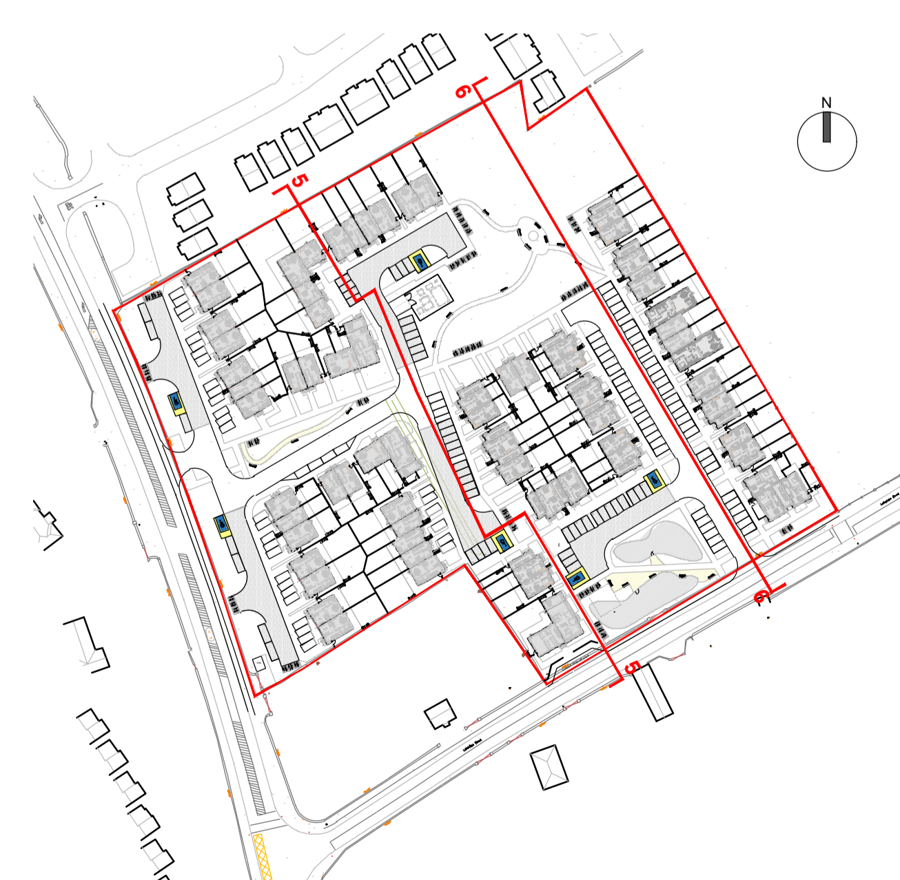
KEY PLAN (Not to scale)

11.38m Level, considered safer from flooding by JBA Report (2020)