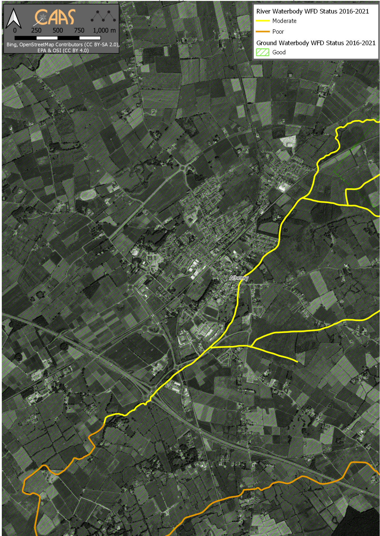
Figure 3.3 Surface Water Status (2016-2021)