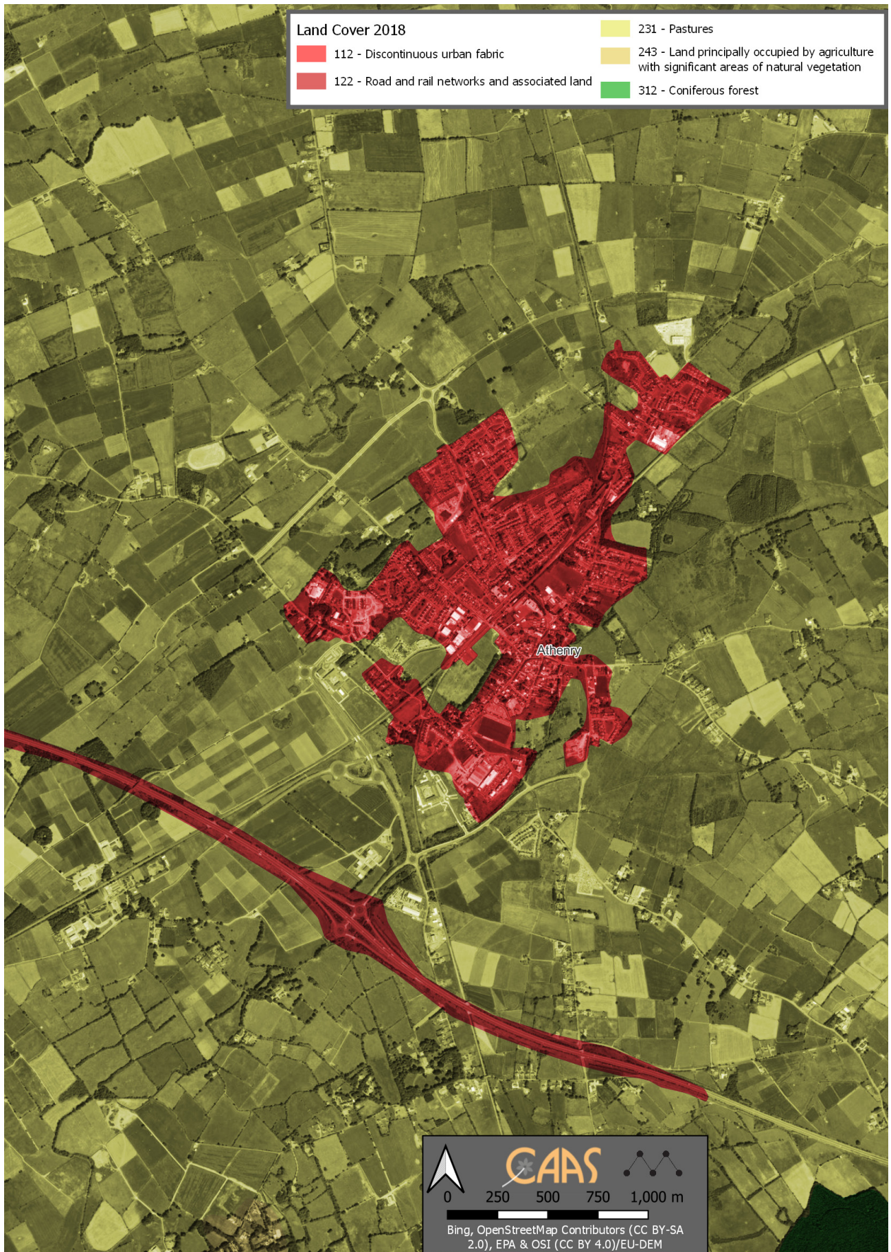
Figure 3.2 CORINE Land Cover Mapping 2018