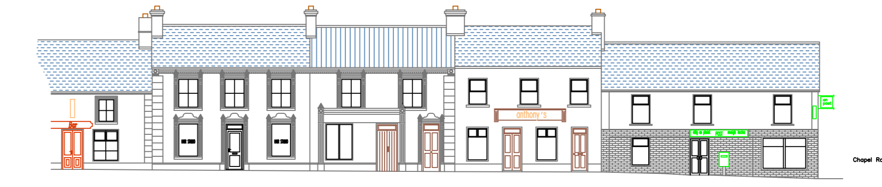
Front Elevation (Main Street)