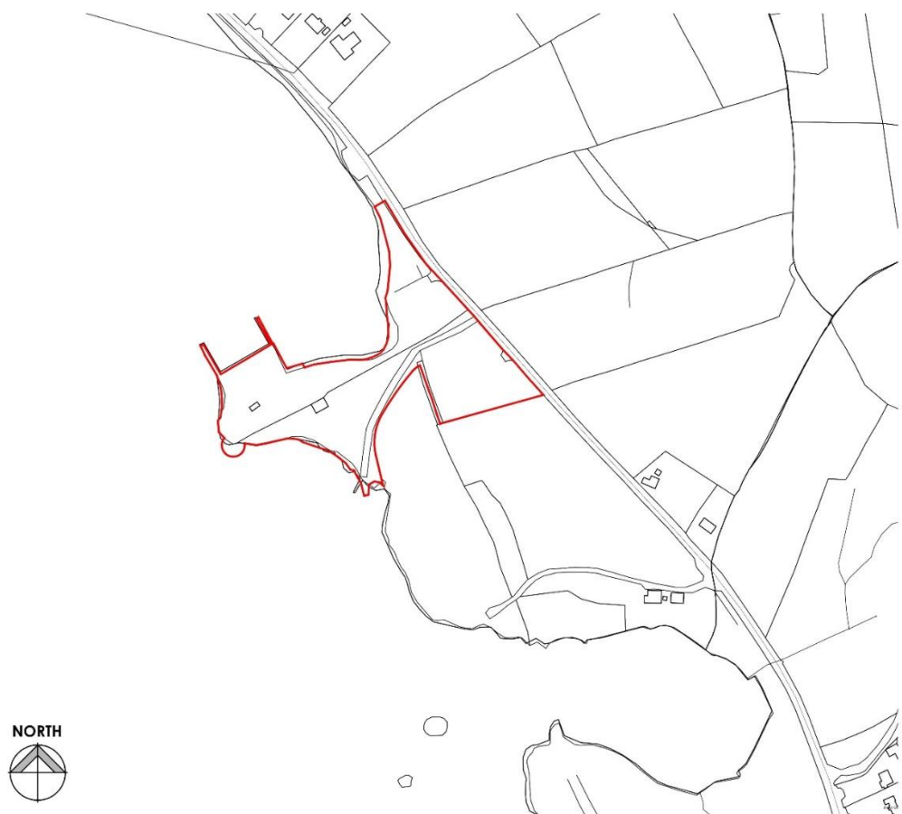
Fig. 1 Site location map

The project site comprises of 2.26 hectares of lakeshore area, with existing changing and temporary lifeguards buildings, car parking, swimming piers, and hard and soft landscaped areas, as outlined in the site location map below: