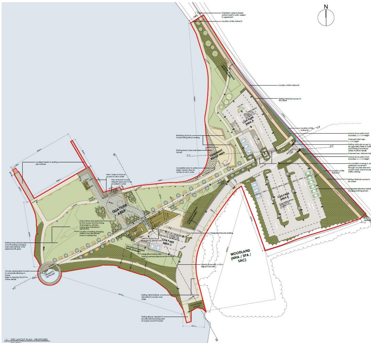
Proposed Site Layout

The project can sub-divided into a number of defined aims and themes set out below. Please refer to the architectural drawings for additional information.