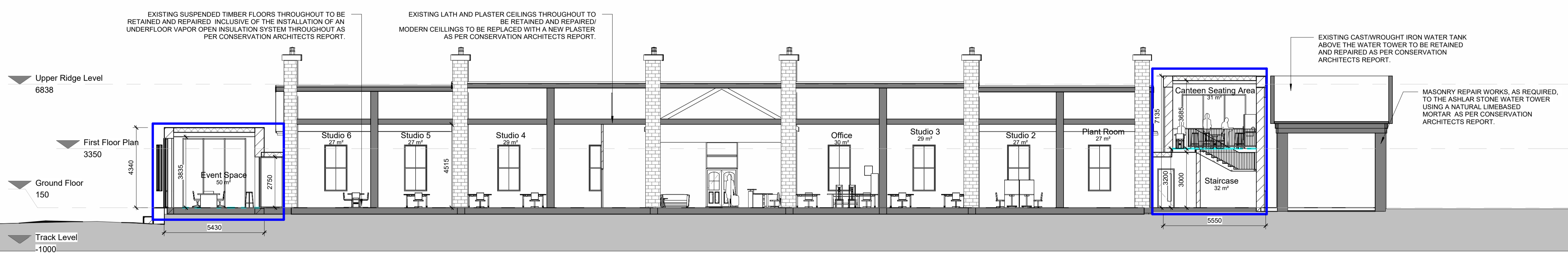
14 Section 5- Proposed 1 : 125