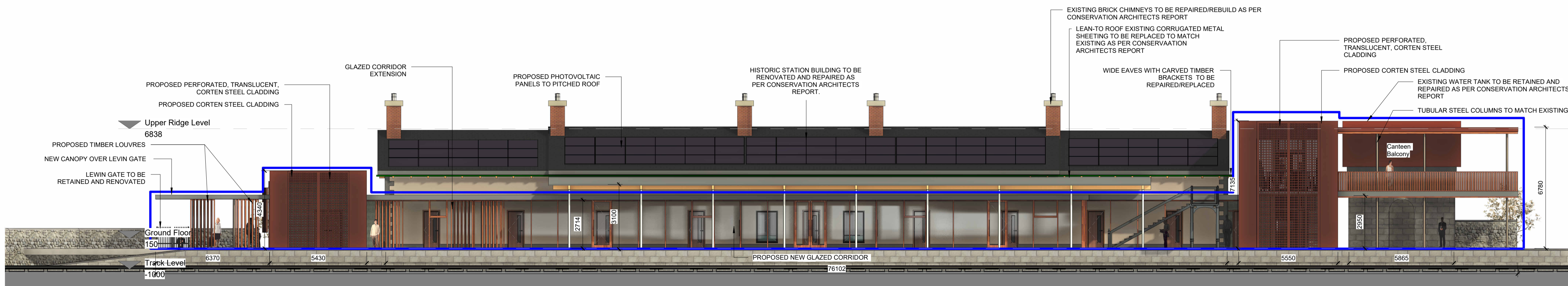
20 South-West Elevation- Proposed to Platform 1 : 125