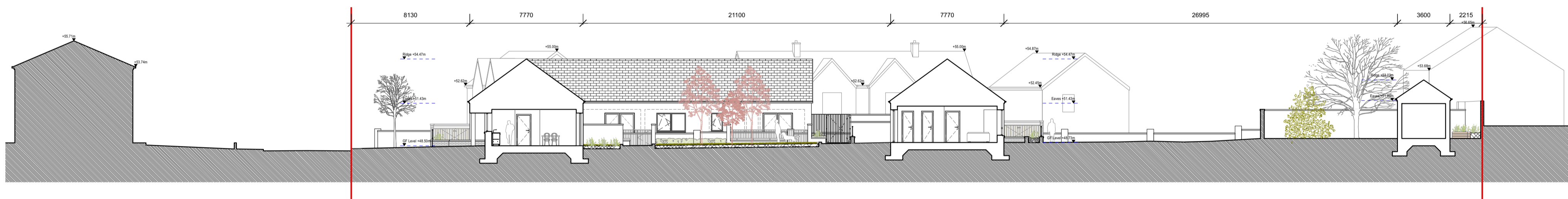
2 SITE SECTION CC 1:200 @A1 / 1:400 @A3