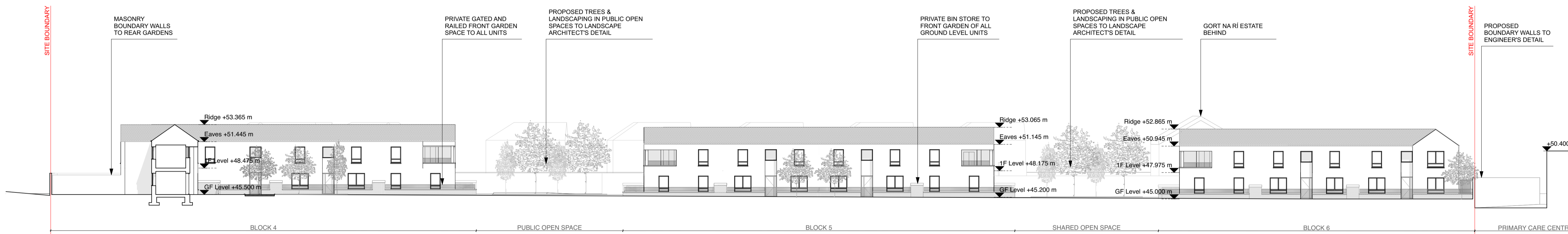
3 SITE SECTION / ELEVATION CC 1:250