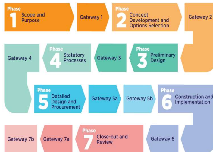
Fig 2- NTA's Project Approval Process