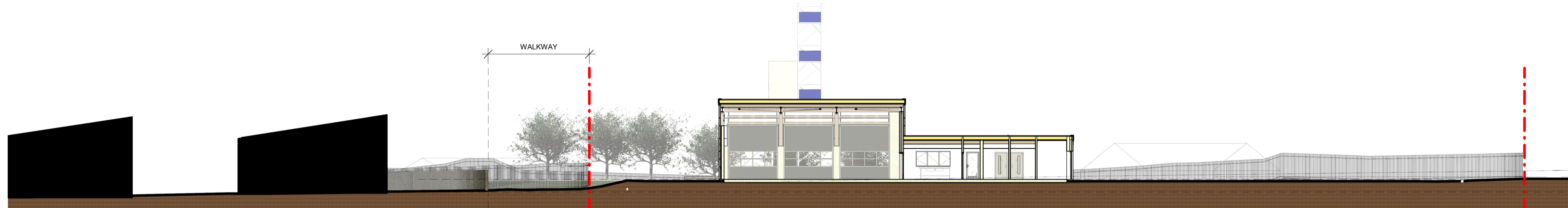
② Section B-B 1 : 200