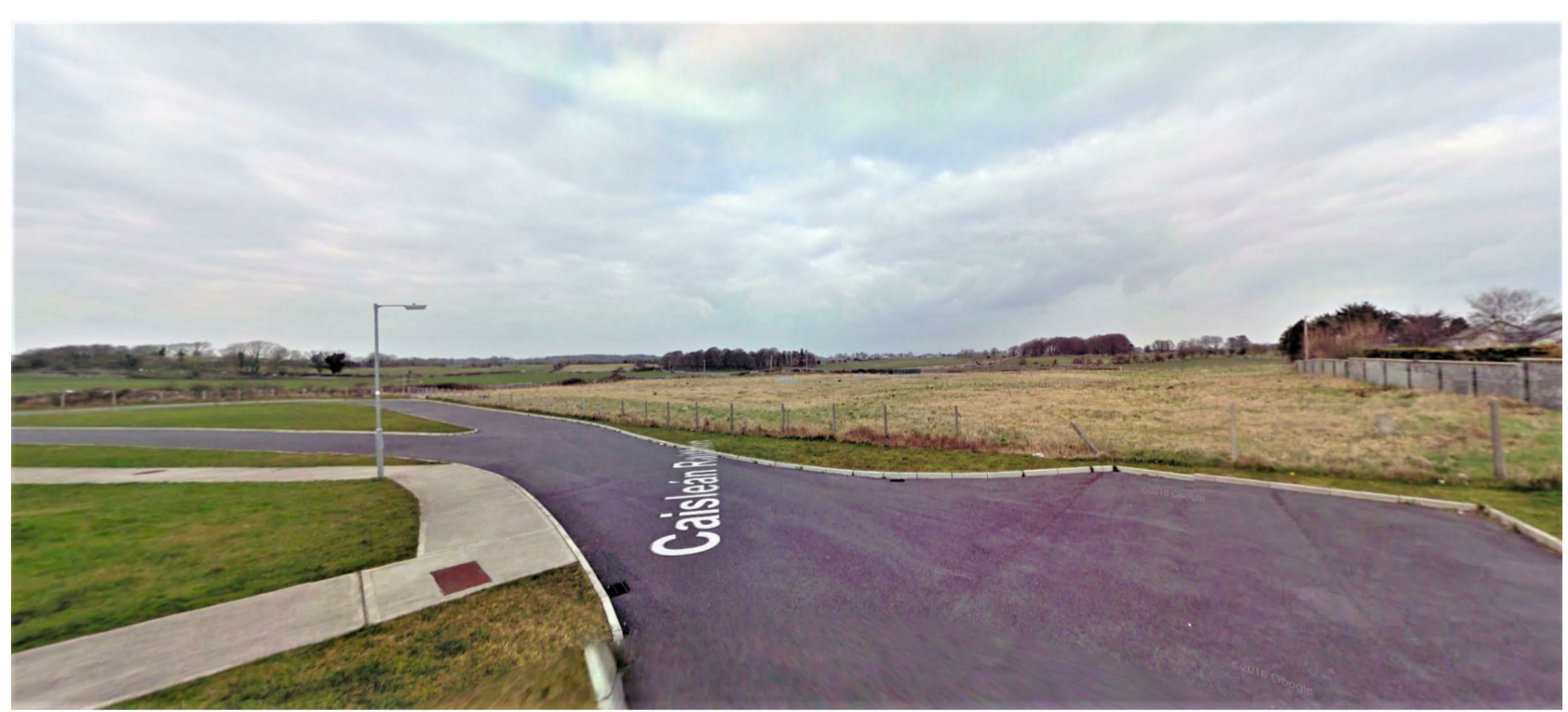
VIEW *A* FROM STREET