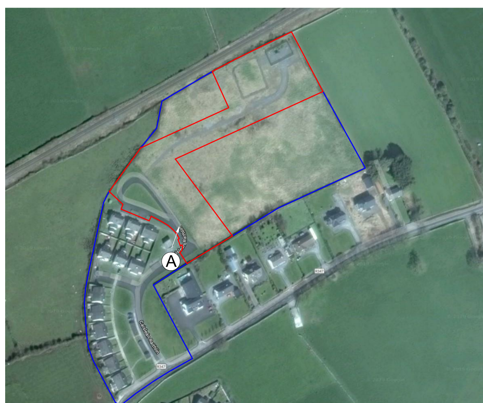
2 AERIAL PHOTOGRAPH MAP 1:2000