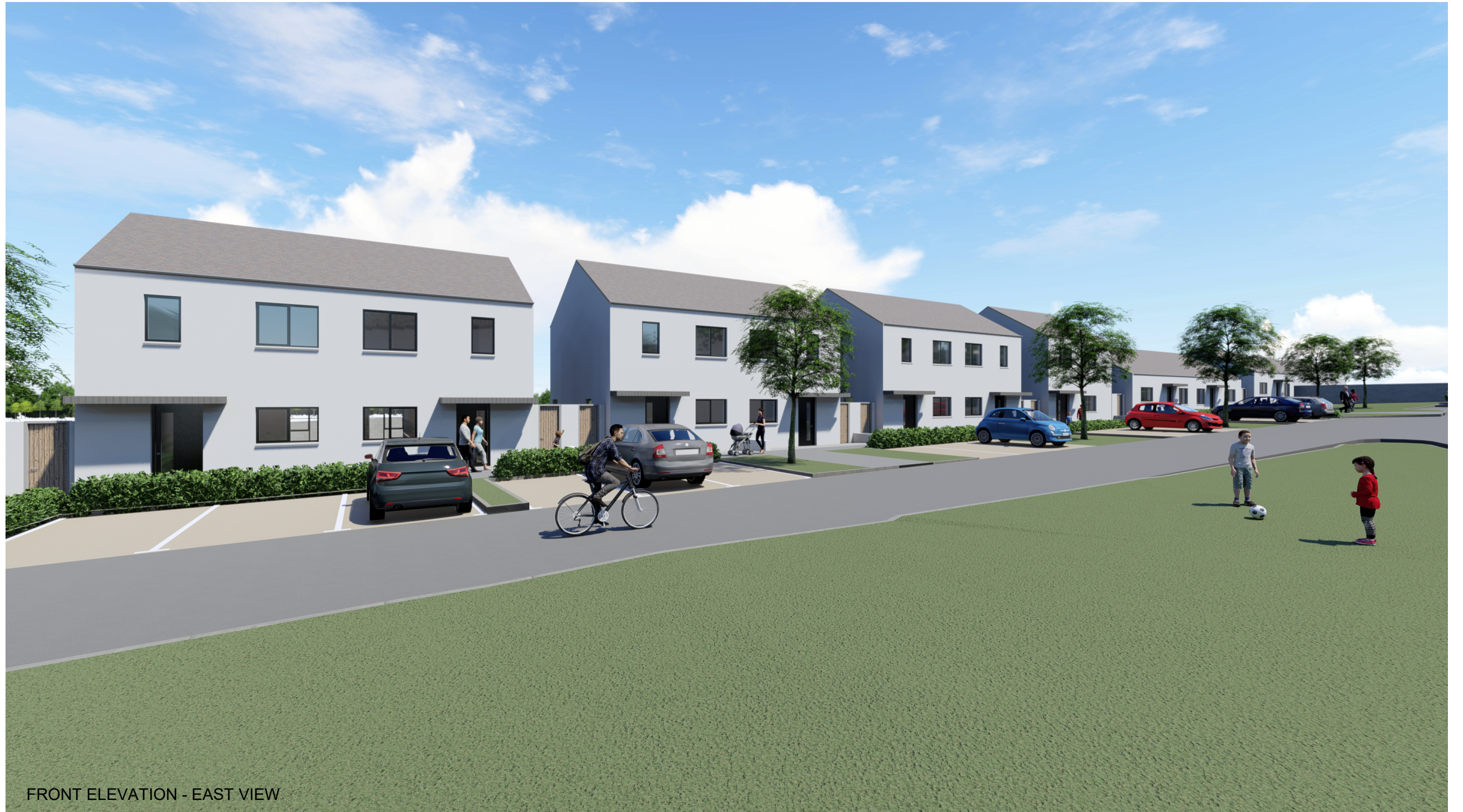
FRONT ELEVATION - EAST VIEW