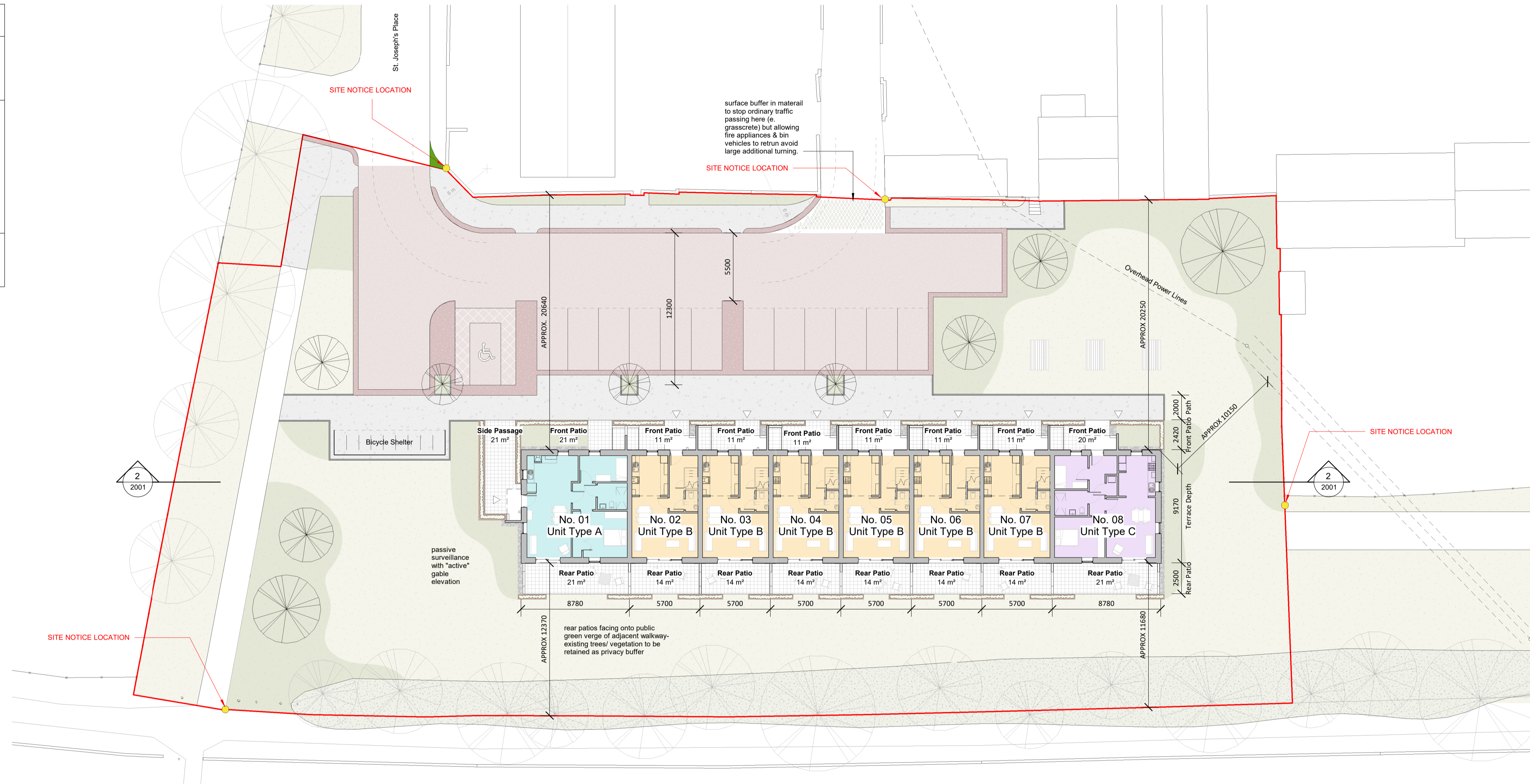
1 Site Plan - Proposed 1 : 200