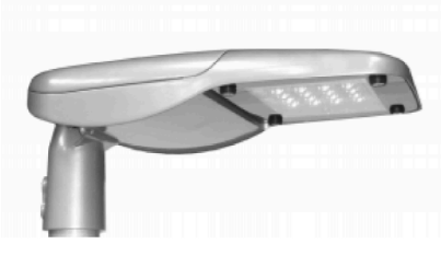
Veille Metro Streetlight on Pole By Electrical Contractor