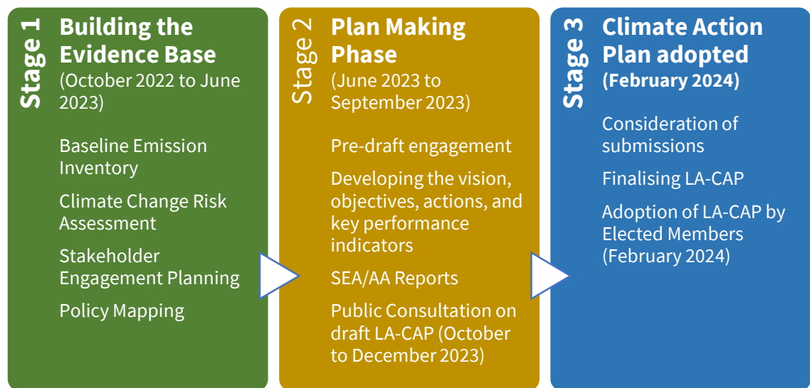
Figure 4.1 Stages in the development of the Climate Action Plan

The development of the Climate Action Plan will follow a number of stages as explained in the Figure 4.1. below.