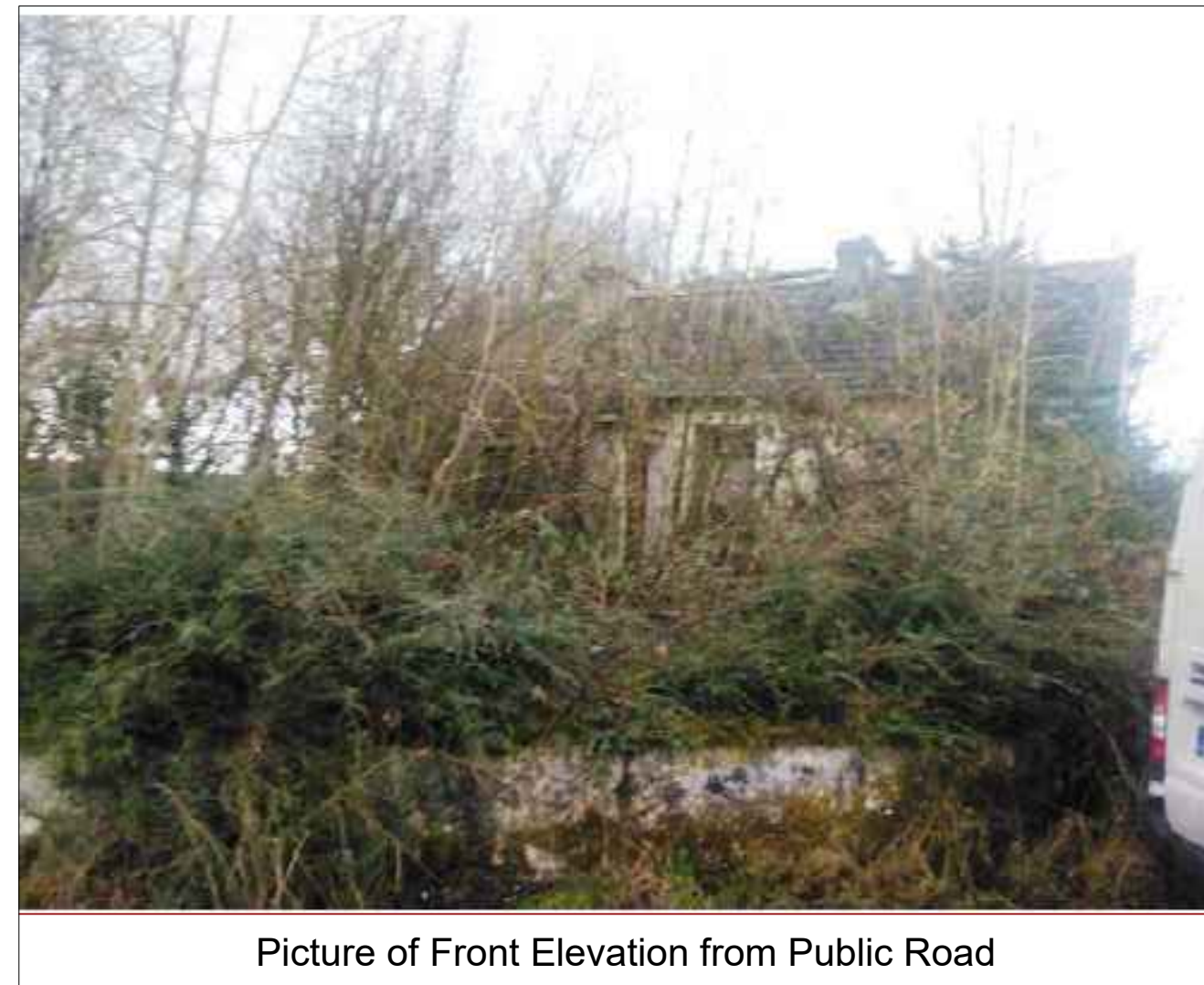
Picture of Front Elevation from Public Road