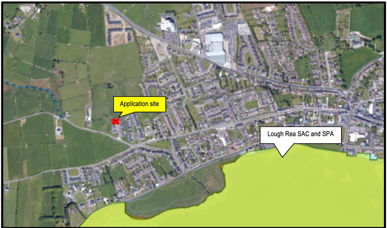
Figure 3: Application site in relation to the Lough Rea SAC & SPA

As per the “ Appropriate Assessment Screening Report ” prepared by Enviroplan Consulting Limited, there is no identifiable pathways and no identifiable connectivity to any European Sites considered in the assessment. This report concludes, inter alia that “ no significant effects are expected on the qualifying interests or conservation objectives of the surrounding Natura 2000 site, as a result of the proposed development in question, alone or in combination with the other plans and projects in the area. ”