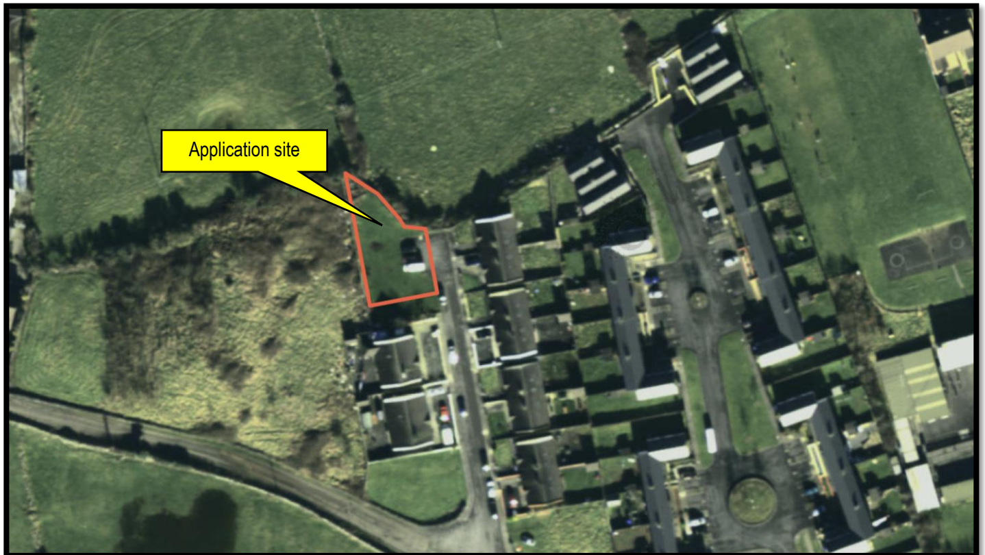
Figure 2.1: Aerial photo extract showing location of subject site in Loughrea.

The application site is located to the 1.6km to the west of Loughrea Town. The proposed development site lies to the north of the Galway Road. The site is an infill site that lies within the Hillcrest estate. There are no potential Source-Pathway-Receptor links between the application site and any SAC or SPA. The application site has no hydrological connections or risks in relation to flooding.