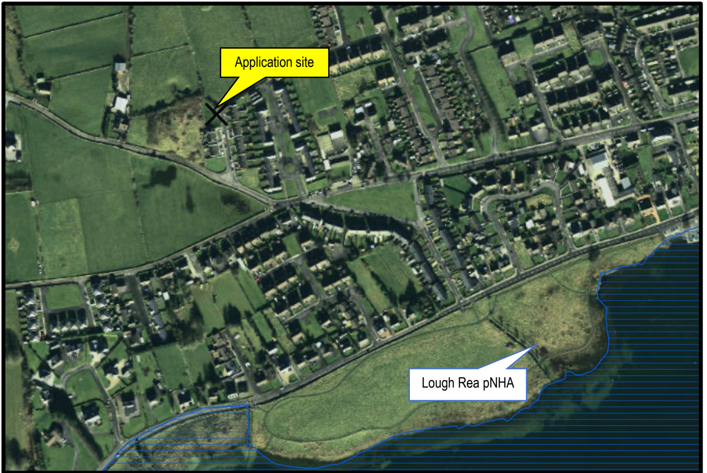
Figure 4: Extract from https://www.npws.ie/ showing the Lough Rea pNHA