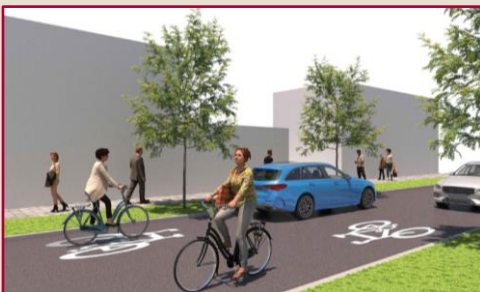
Mixed Traffic Facilities (where feasible)