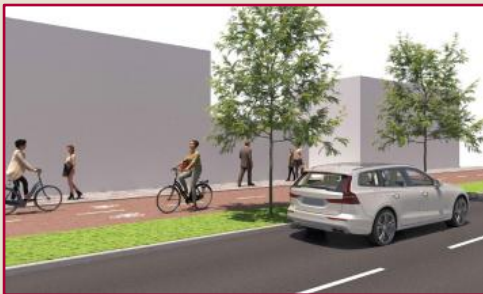
Standard Cycle Track (One-way and Two-way)