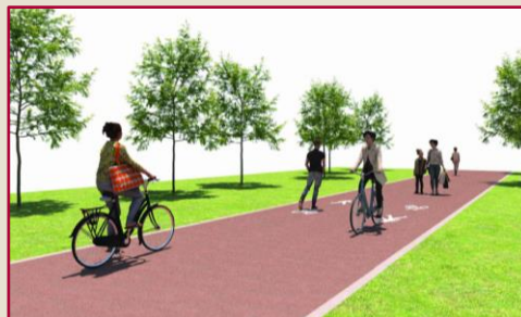
Shared Active Travel Facilities