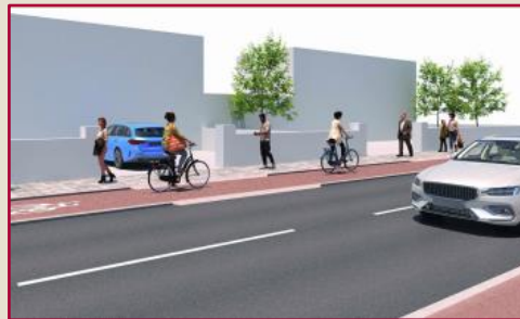
Stepped Cycle Track (One-way only) either side of the road