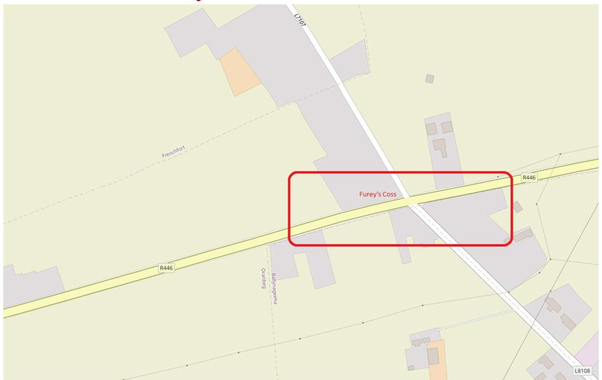
Figure 0.1: Scheme Area – Furey's Cross R446/L8101/L7107