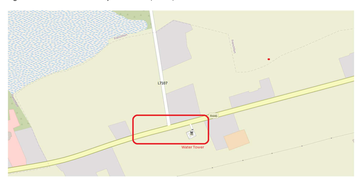
Figure 0.3: Scheme Area – R446/L7107 Junction at Water Tower