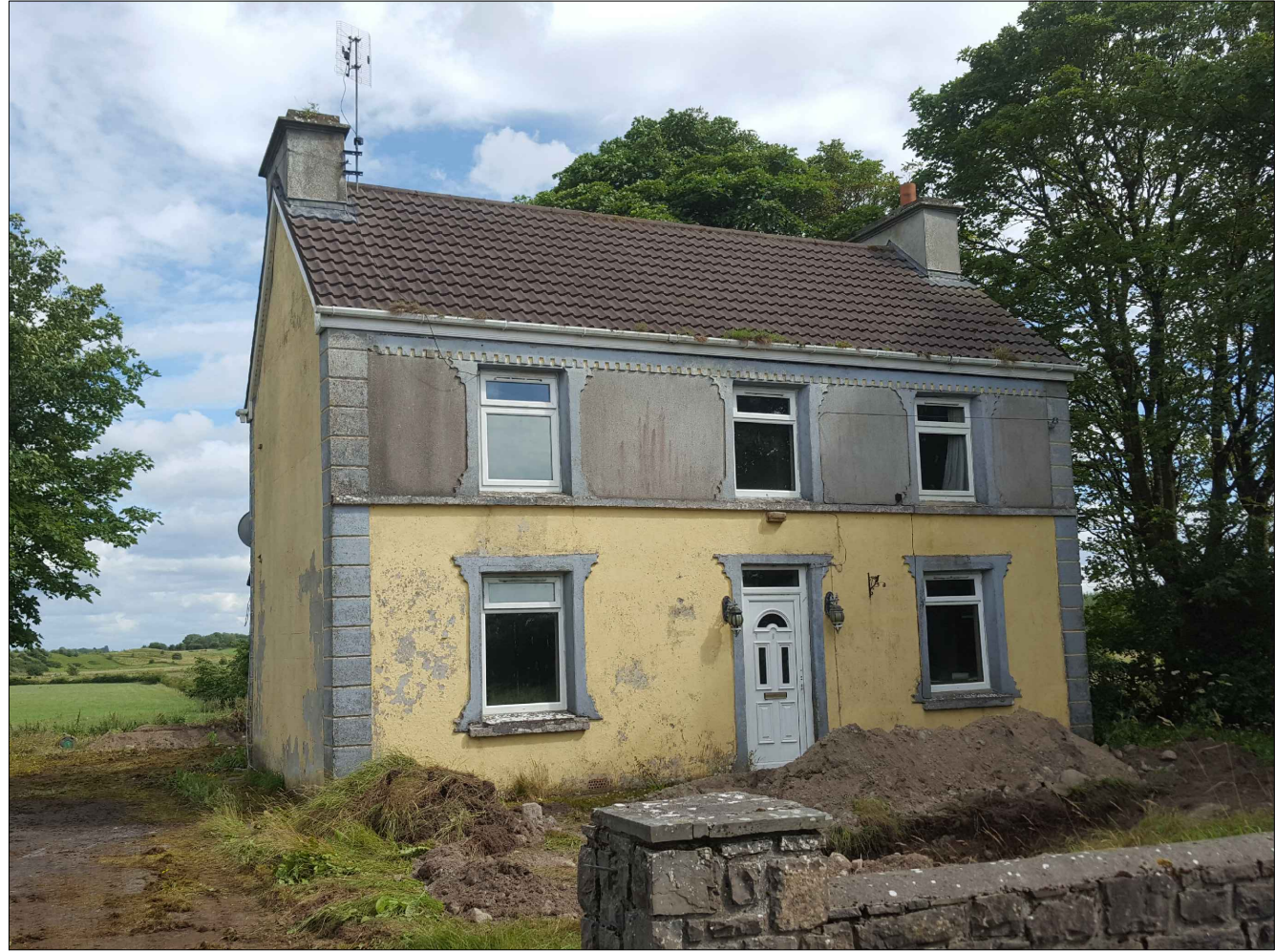
Picture of Front Elevation from Public Road