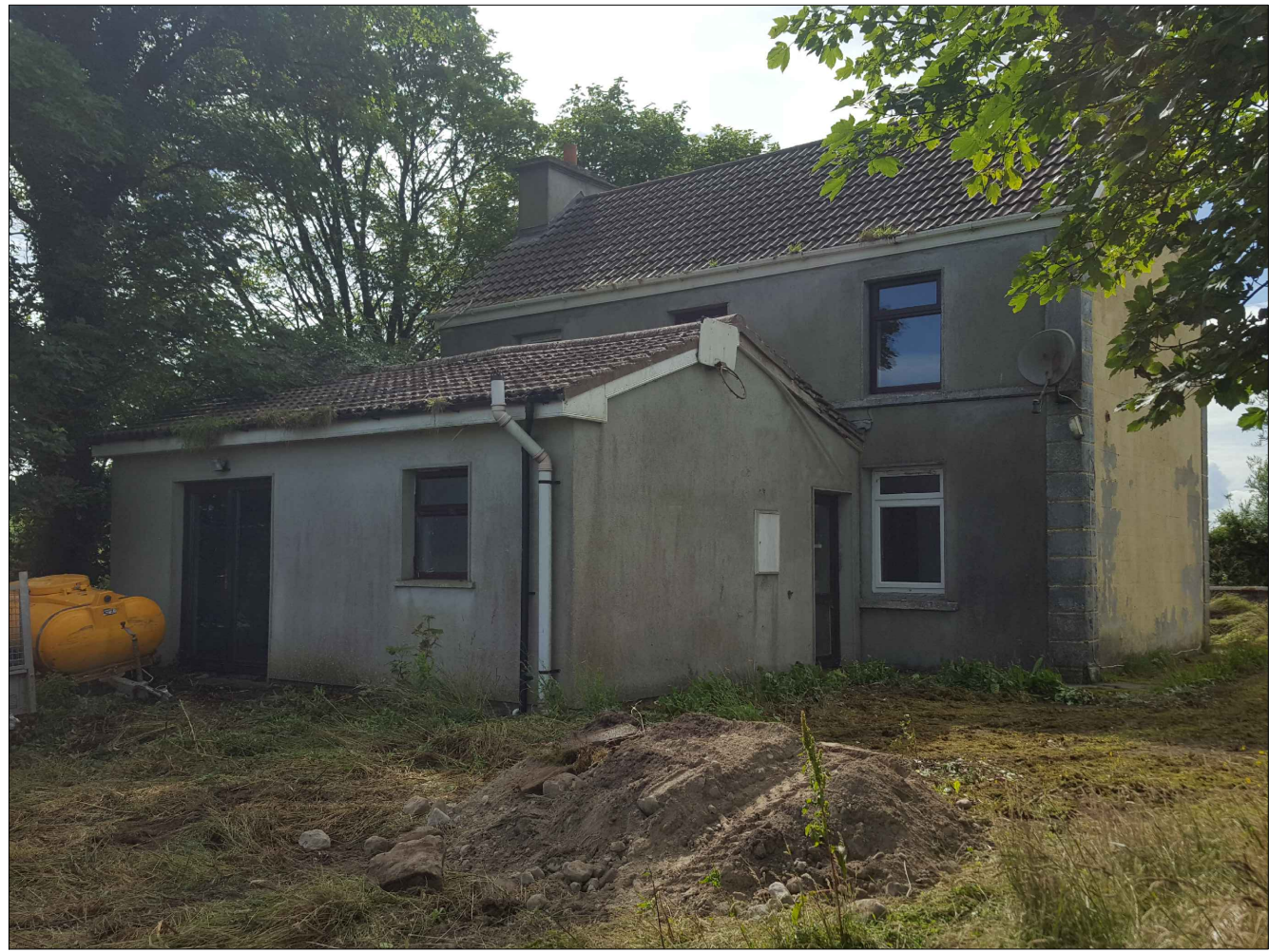
Picture of Rear Elevation