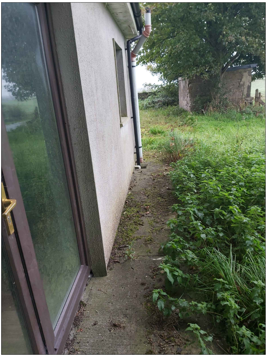
Picture to Rear