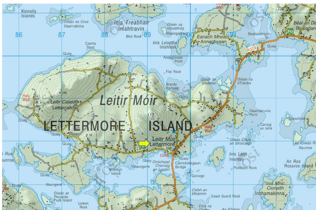
Fig 1 : Location Map

The site of the proposed development is to the rear of the existing cemetery at Leitir Móir which is located approximately 600m due west from the Parish Church of Saint Cholmchille's, on the R374. The area for development measures 0.37 acres. Access to the development will be through the existing burial ground entrance from the L-5228 public road.