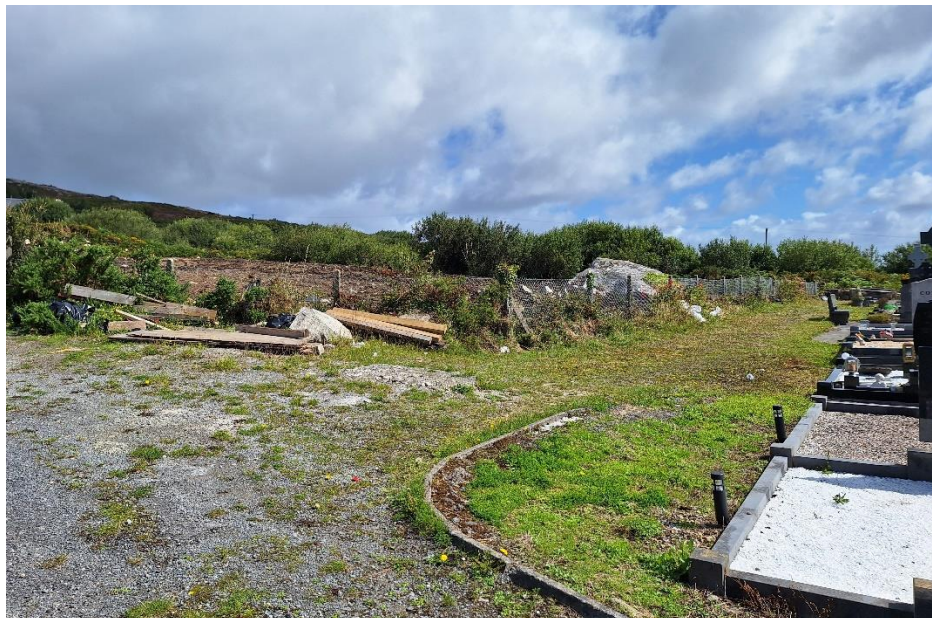
Fig 2 : Area of Proposed Development in Background

The subject site is located in a Coastal Landscape categorised of Special Sensitivity, Value 3. The proposed development will be an extension of smaller scale to the existing burial ground and will be consistent in character with the adjacent facility. The tree line bordering the west of the development will be preserved and native hedging will be planted along the proposed fenceline.