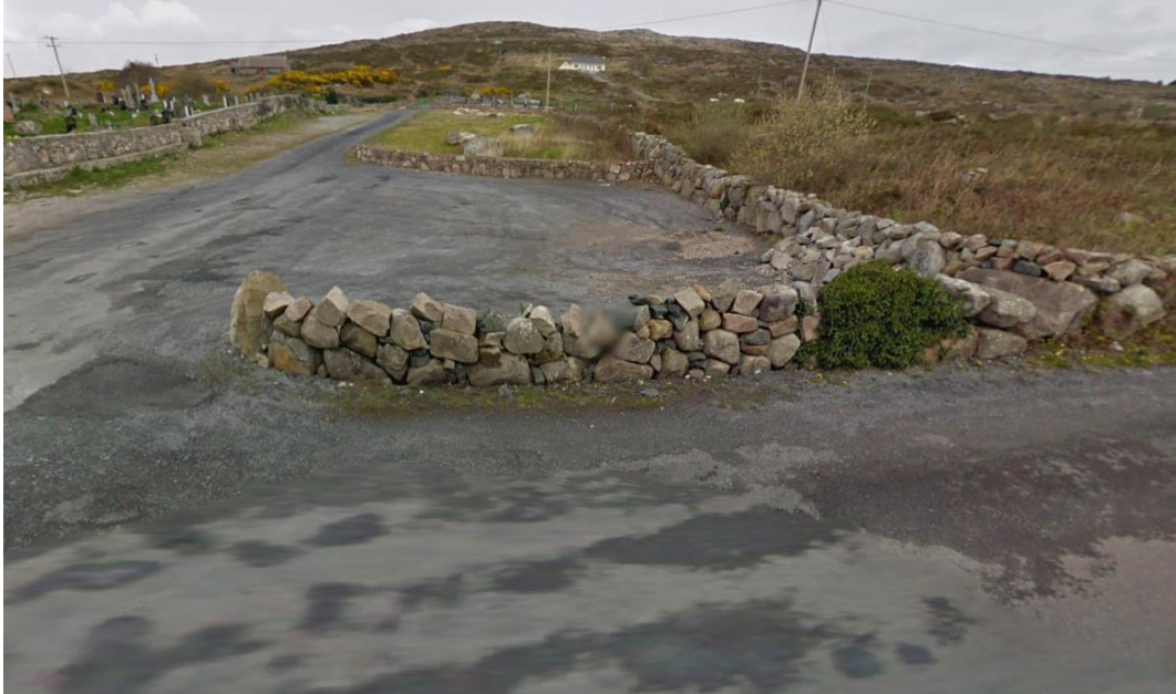
Fig 3 : Entrance from L-5228

Access to the proposed development from the public road L-5228 is already in place. No intensification of traffic is expected to arise as a result of the extension to the existing facility.