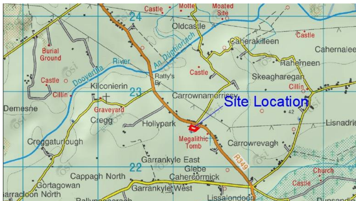
Fig 1 : Location Map

The site of the proposed development is adjacent to the existing cemetery at Kilconieron which is located approximately 8 km south east of Athenry. The site measures 0.5 acres and comprises of a level field of agricultural grassland.