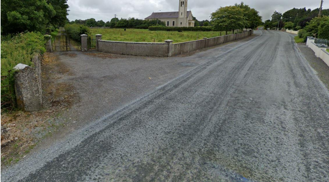
Fig 3 : Existing entrance from R-349