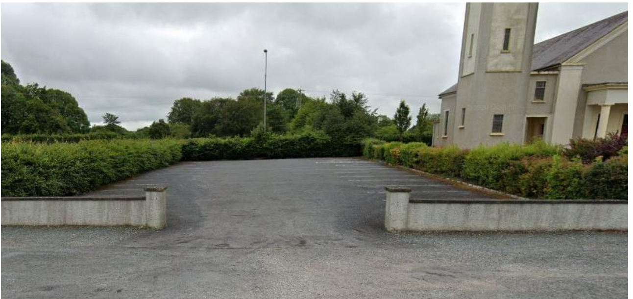
Fig 4 : Church Parking Area