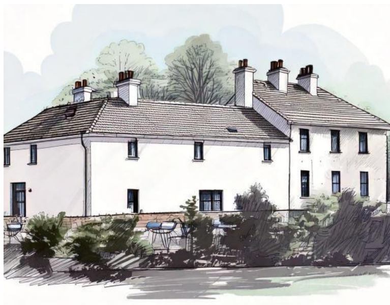
Figure 1 : Restored Flowerdale house - cafe and interpretive centre

Imagine cycling into Gort along the scenic Galway-Athlone Cycleway, arriving at a modern Cycle Hub just minutes from the town centre. Here, you can secure your bike, refresh with a hot shower, and relax in a welcoming heritage café before setting off to explore. Wander through Gort's historic streets, and the town's vibrant market square and local shops. Take while to visit cultural landmarks like Coole Park, Thoor Ballylee, and the Kiltartan Gregory Museum. When you're ready to continue your journey, the Gort Railway Station—just 50 metres away—offers seamless connections to Galway, Limerick, and Dublin, or stay another night in a vibrant hostel. Whether you're on a long-distance cycling adventure or a day trip, Gort provides the perfect stop to recharge, experience local culture, and effortlessly transition from saddle to station.