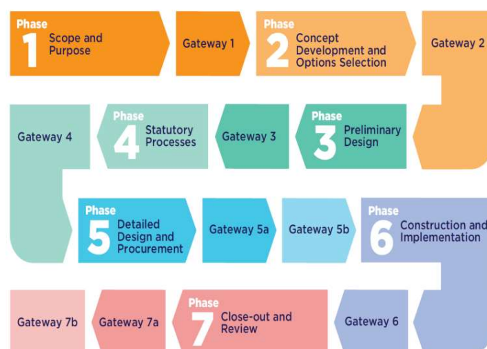
Fig 2- NTA's Project Approval Process

We are currently in Phase 2 (Gateway 2/3 approval) of a 7 stage NTA Project Approval Process. Fig 2 below illustrates the 7 stages of this process.